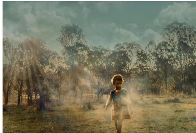
Tracey Moffatt, The Visit , 2019, C-Type print, 79 x 73 cm; 79 x 117 cm.

Unlike the more stylized manner of her "Passage," series that was presented for the Australian Pavilion at the Venice Biennale in 2017, the haunting effect that Moffatt devised in her earlier "Spiritual