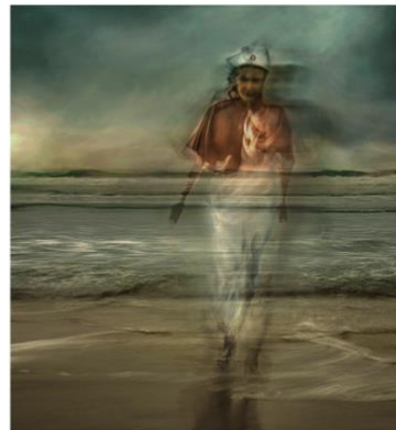
Tracey Moffatt, The Hospital Ship , 2019, C-Type print, 79 x 117 cm; 79 x 73 cm.