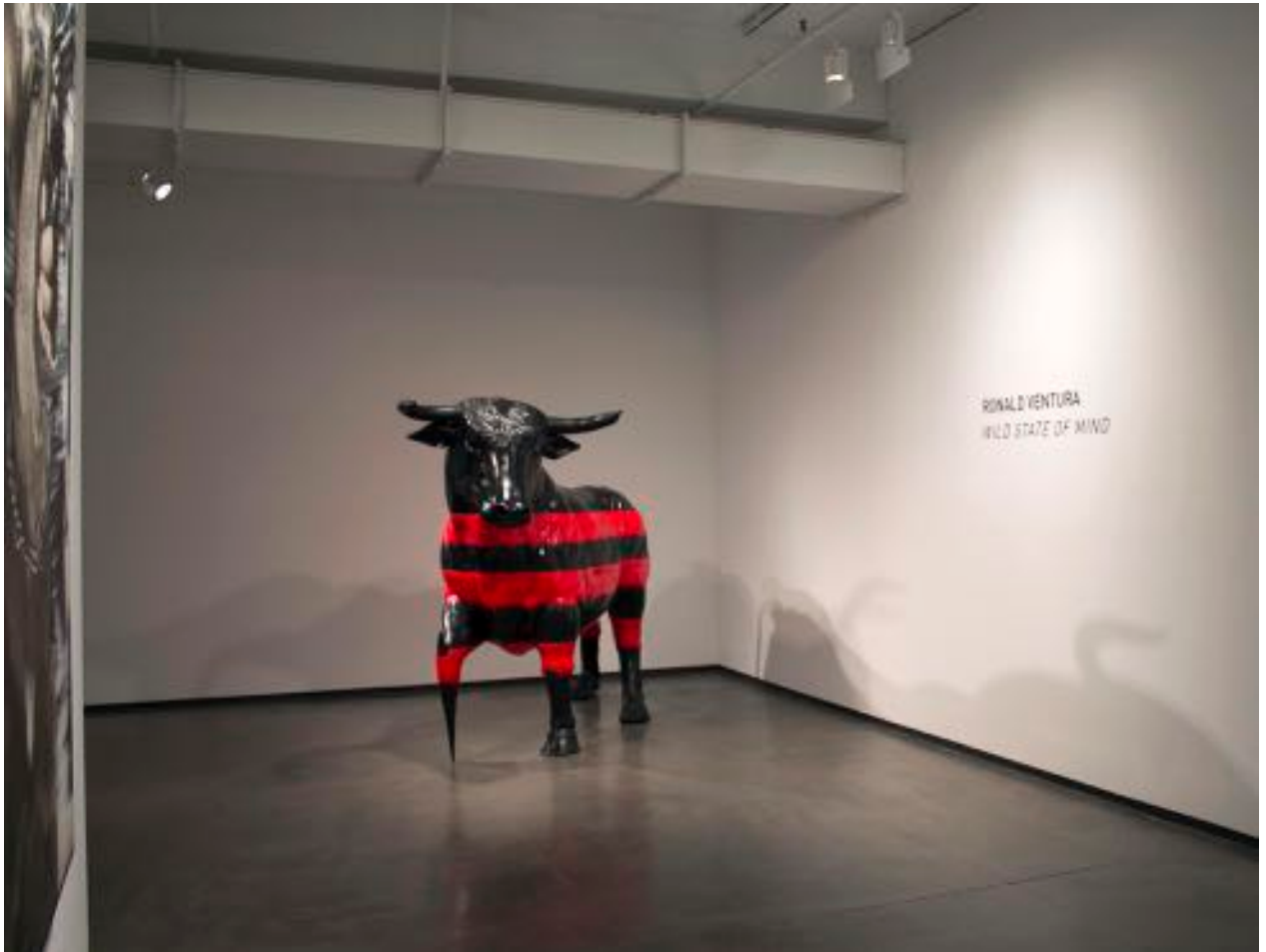
VIEW OF THE EXHIBITION AT TYLER ROLLINS FINE ART