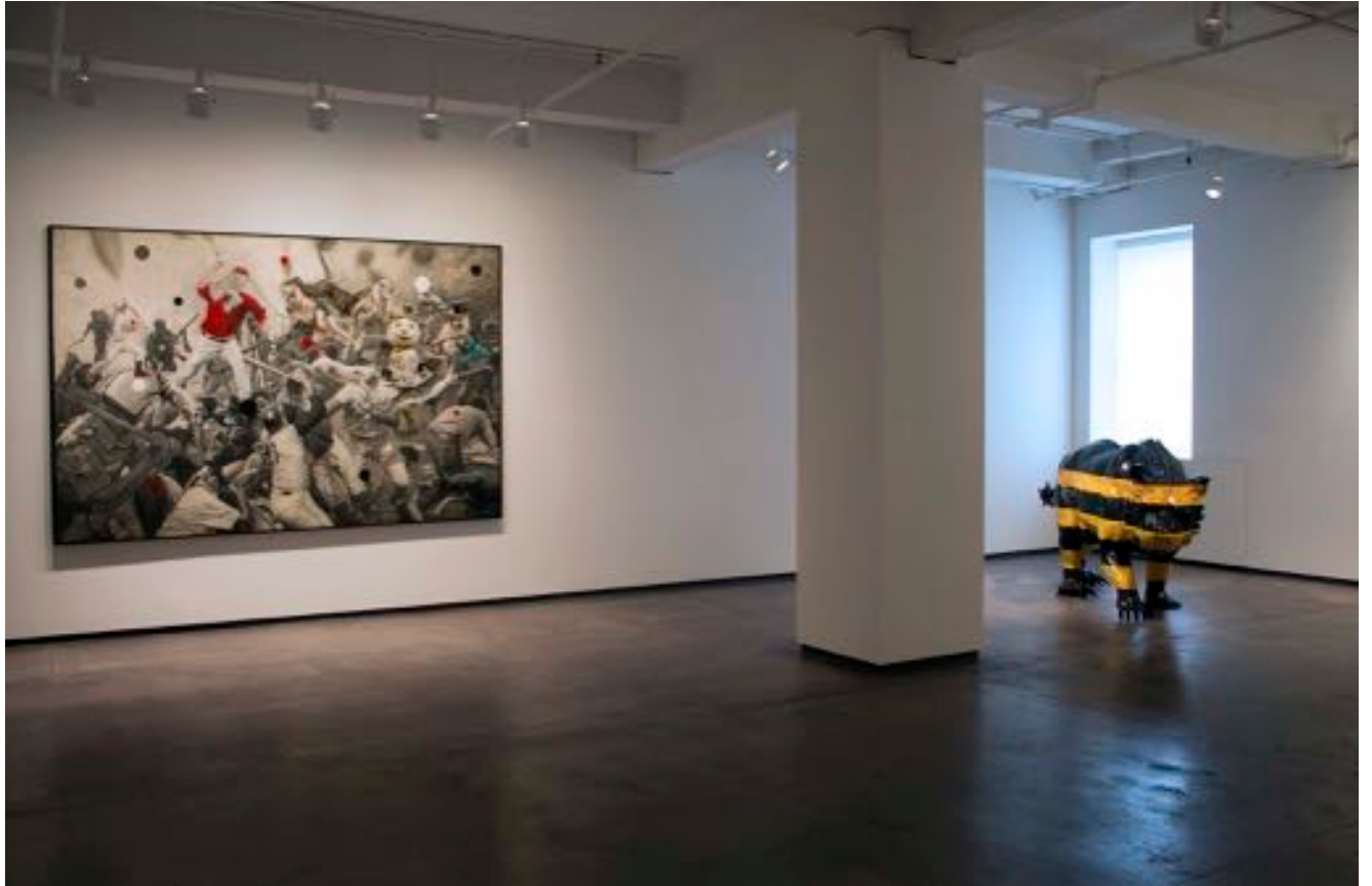
VIEW OF THE EXHIBITION AT TYLER ROLLINS FINE ART