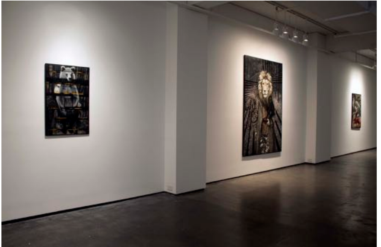
VIEW OF THE EXHIBITION AT TYLER ROLLINS FINE ART