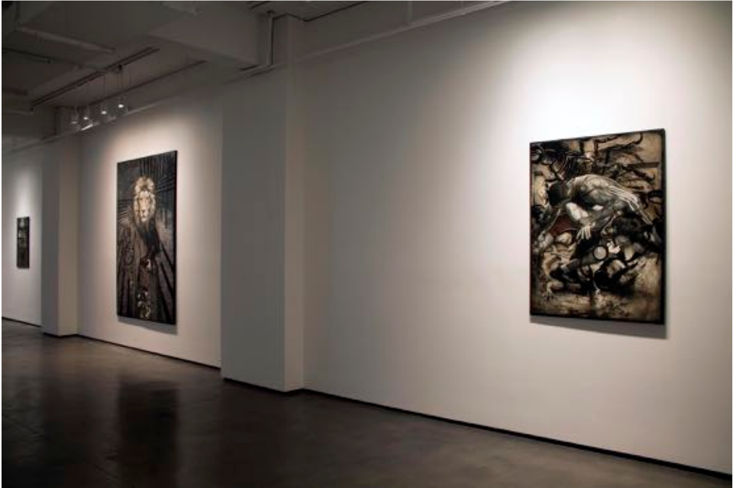
VIEW OF THE EXHIBITION AT TYLER ROLLINS FINE ART