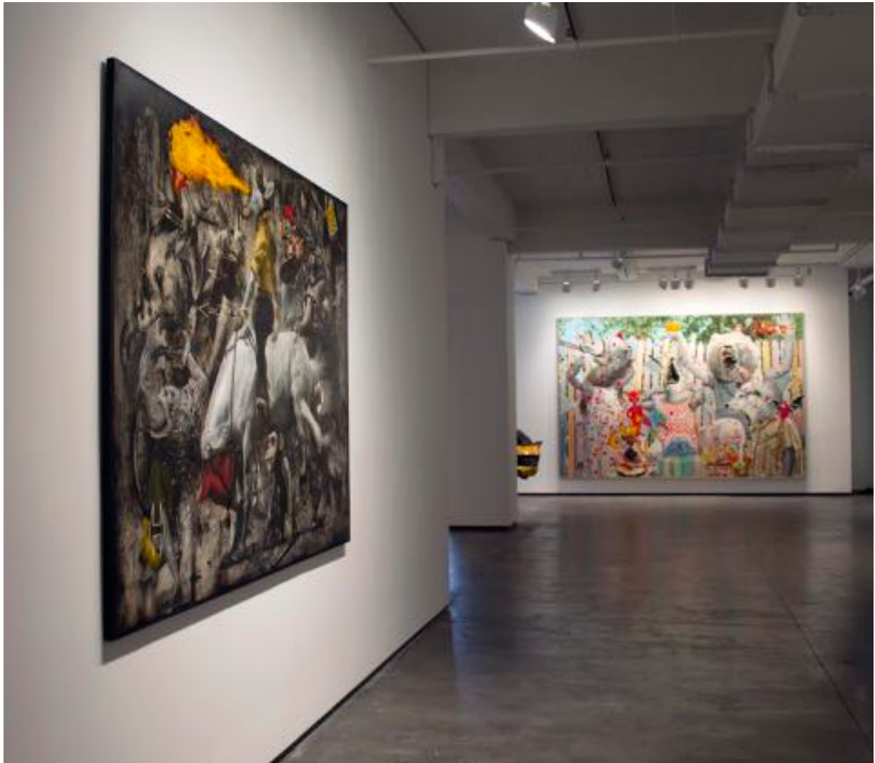
VIEW OF THE EXHIBITION AT TYLER ROLLINS FINE ART