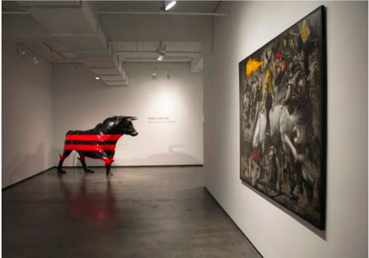
VIEW OF THE EXHIBITION AT TYLER ROLLINS FINE ART