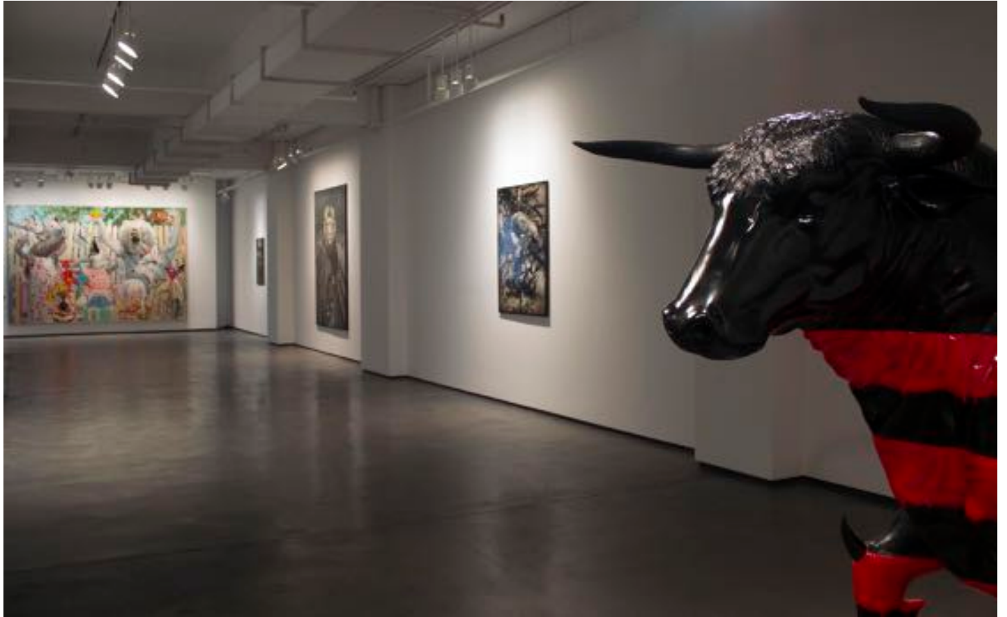
VIEW OF THE EXHIBITION AT TYLER ROLLINS FINE ART