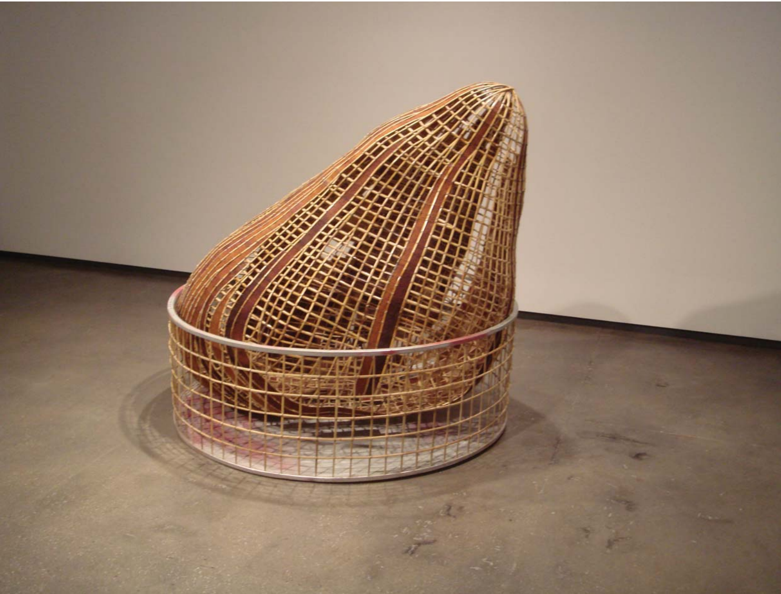
Sopheap Pich, Caged Heart , 2009 , wood, bamboo, rattan, burlap, wire, dye, metal farm tools, installation view, Tyler Rollins Fine Art, New York, 2009 (artwork © Sopheap Pich)