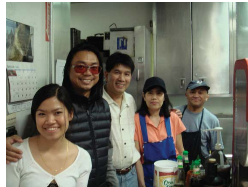
Rirkrit Tiravanija with the staff of Sunny's Café at the School of the Art Institute of Chicago, January 2008

as art advisors and curators rather than dealers. Similarly, artist-run spaces have acted as agents for younger artists, securing clients and negotiating exhibitions with international museums. In Vietnam, spaces such as Nha San Duc in Hanoi and San Art in Ho Chi Minh City have acted as liaisons between collectors and buyers, curators and museums. In Singapore, the Substation has acted as a forum for experimental art practices, and in Indonesia, Cemeti has created a space for artists and critics to research contemporary art practices and create works without government interference. In Ho Chi Minh City, a number of spaces for readings, lectures, and exhibitions have recently opened, such as Wonderful District, Zero Station, Salon Himiko, and Rich Streitmatter-Tran's Dia Projects. These are grass-roots projects that are fitting to Southeast Asian circumstances because most of these countries, aside from Singapore, lack the proper infrastructure for art to thrive on an official level. It takes individual initiatives to get things moving.