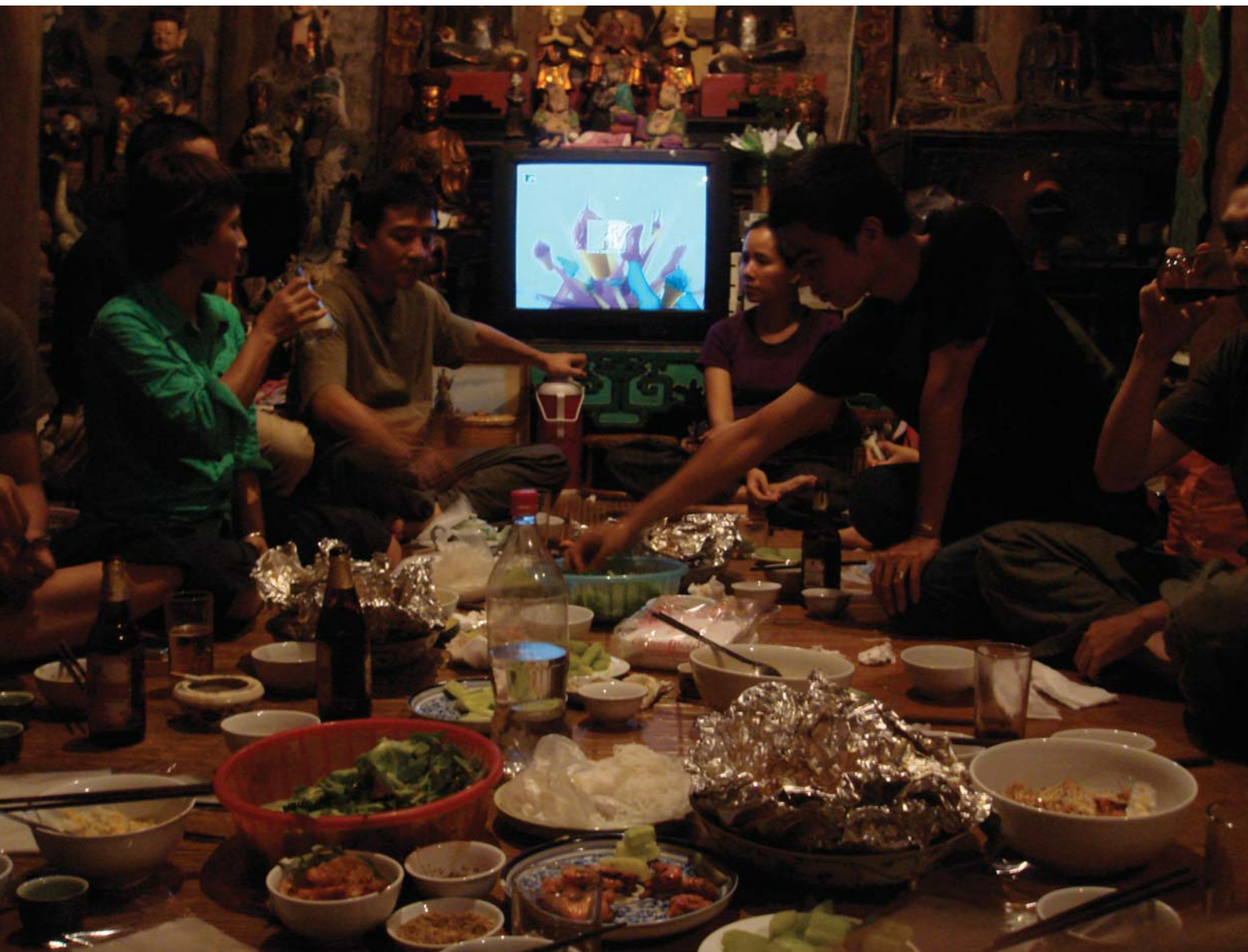
Artists gather at Nha San Duc, Hanoi, Vietnam, 2009