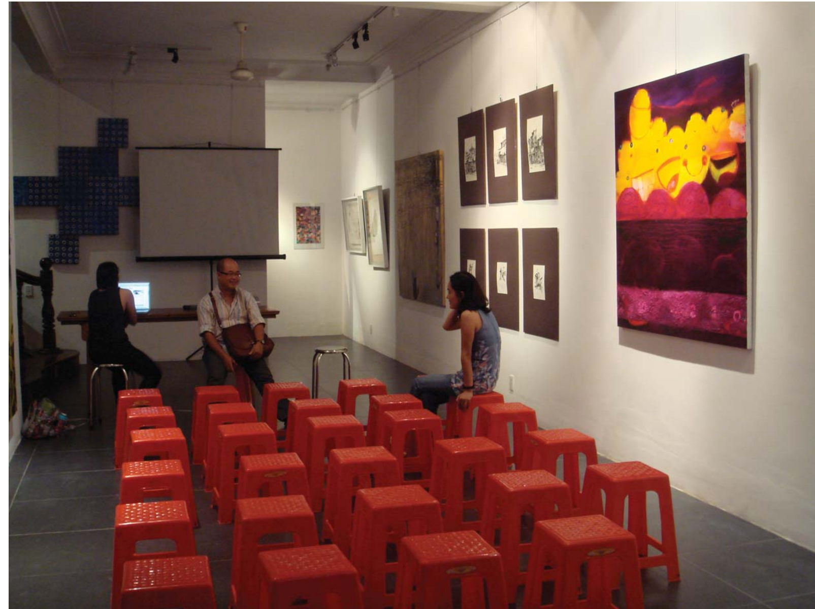
Interior of San Art, Ho Chi Minh City, 2009

Art in 2003, and 50 Years of Modern Vietnamese Art: 1925–1975 in 2005.