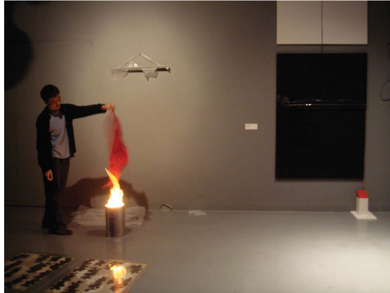
Tran Luong, Welts, year of creation TK, performed at ARKO, Seoul, Korea, January 2008 (artwork © Tran Luong)