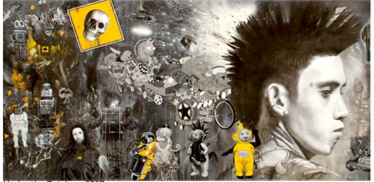
Under the Rainbow, 2007