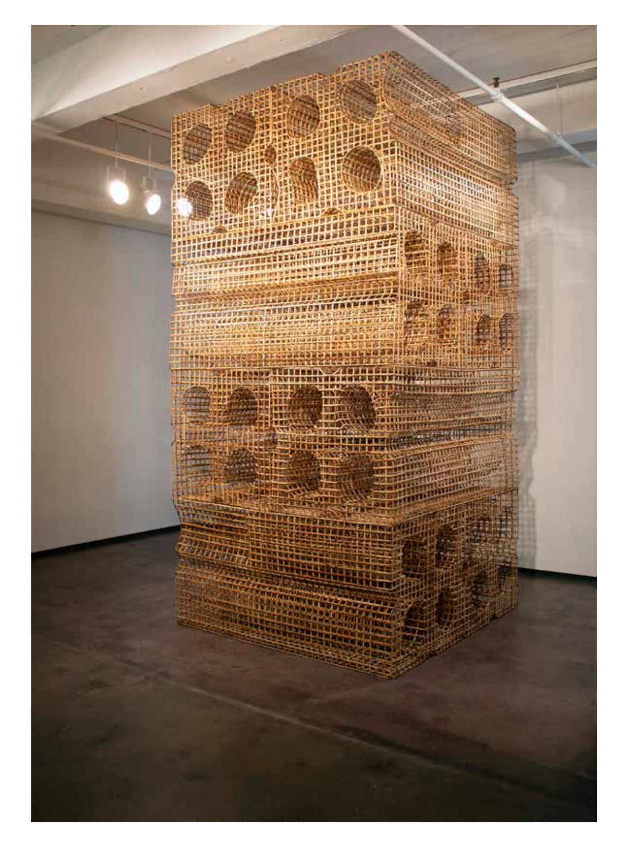
NEW DWELLINGS 2018 bamboo, rattan, wire 126 x 63 x 63 inches (320 x 160 x 160 cm)