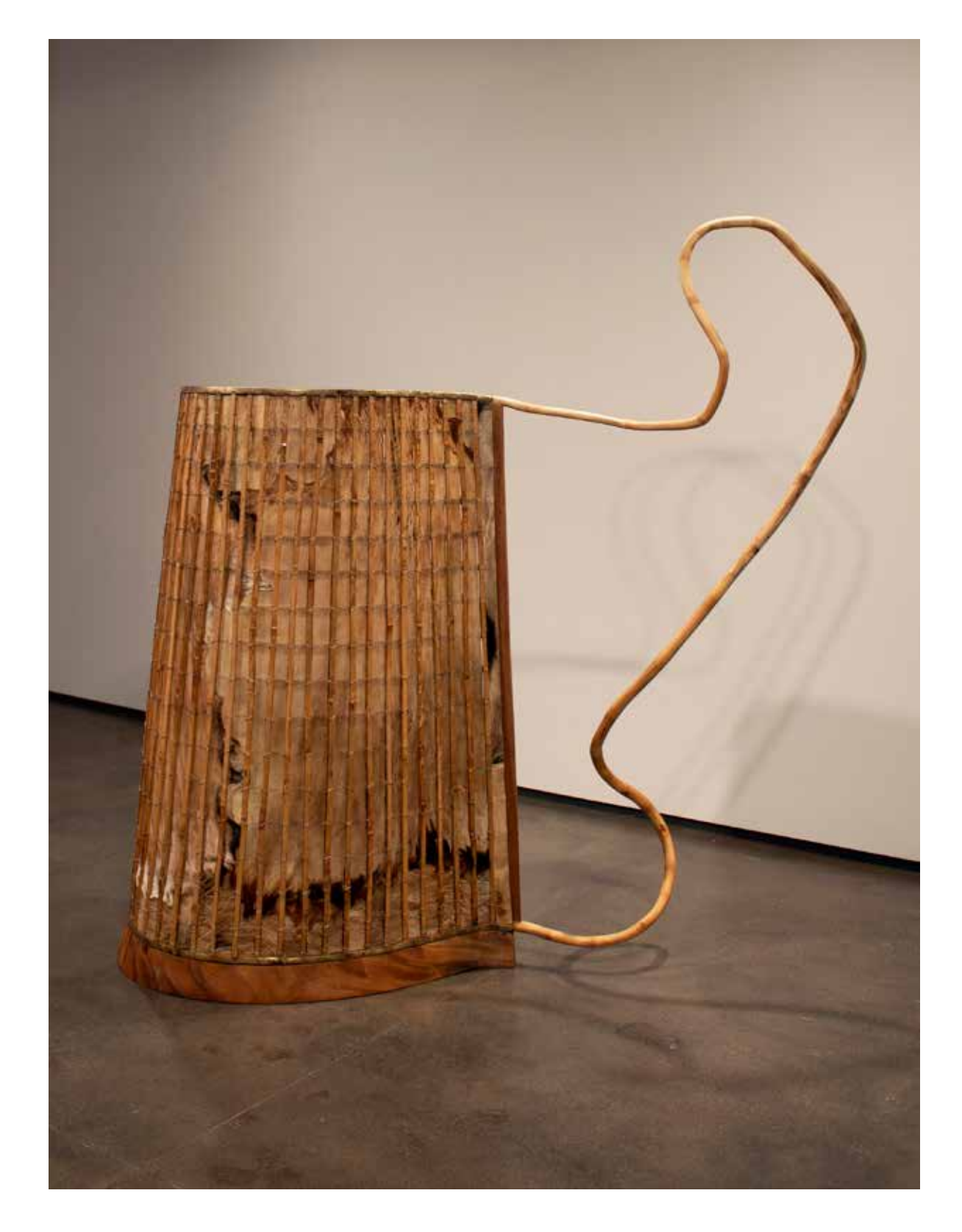
LOVE HILL TRAIL 2018 bamboo, wood, goat hide, wire, bronze 67 3/4 x 64 x 26 inches (172 x 163 x 66 cm)