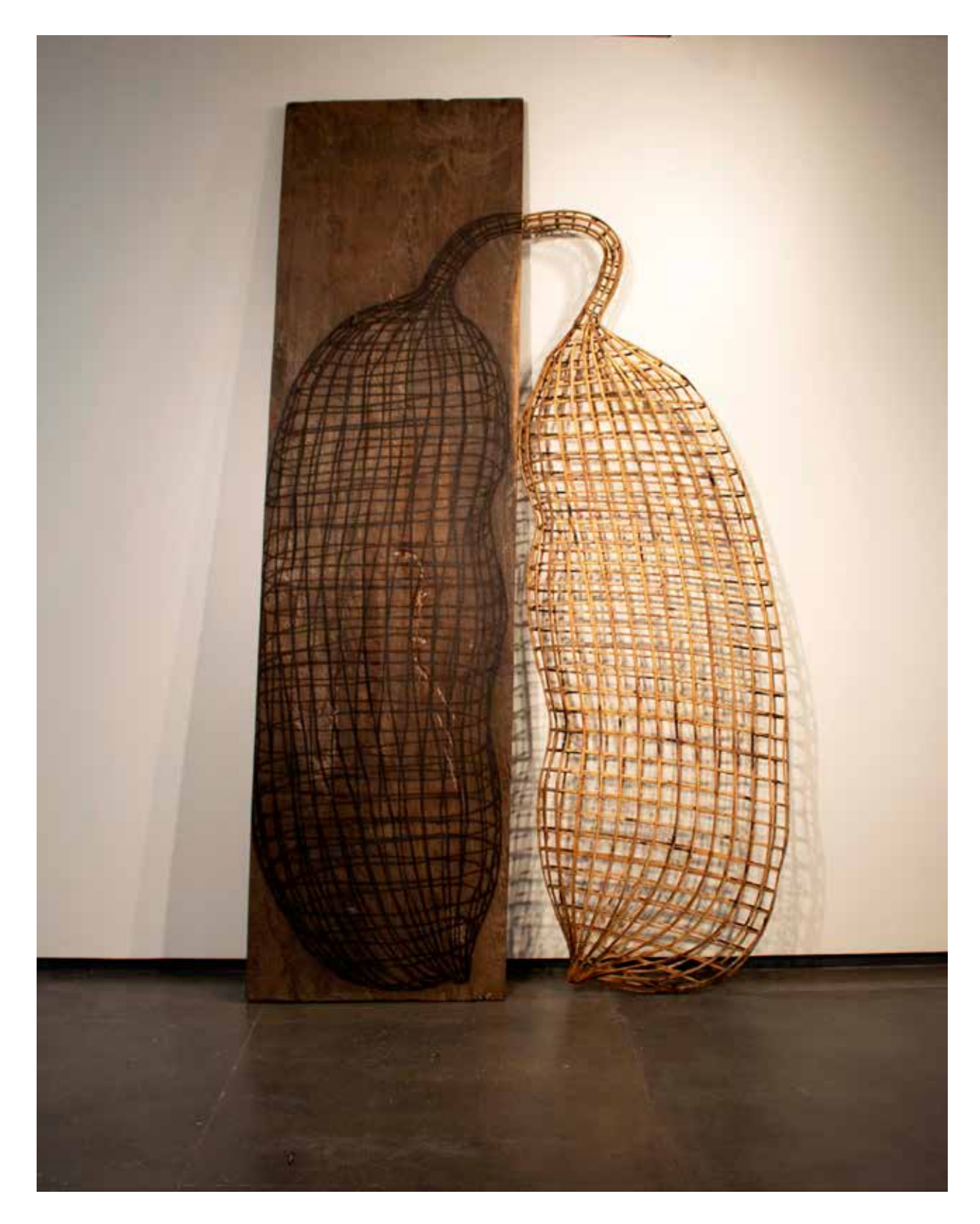
DYAD 2019 wood, bamboo, rattan, wire 117 ¾ x 65 ¼ x 12 ¼ inches (299 x 166 x 31 cm)