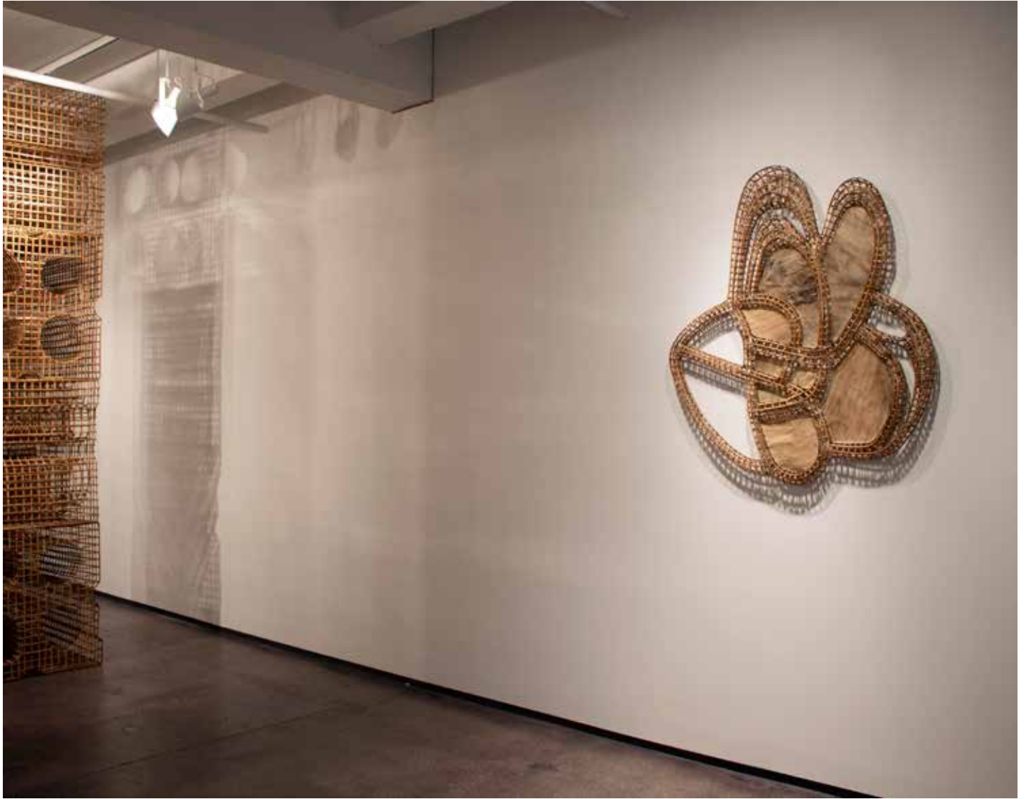
VIEW OF THE EXHIBITION AT TYLER ROLLINS FINE ART