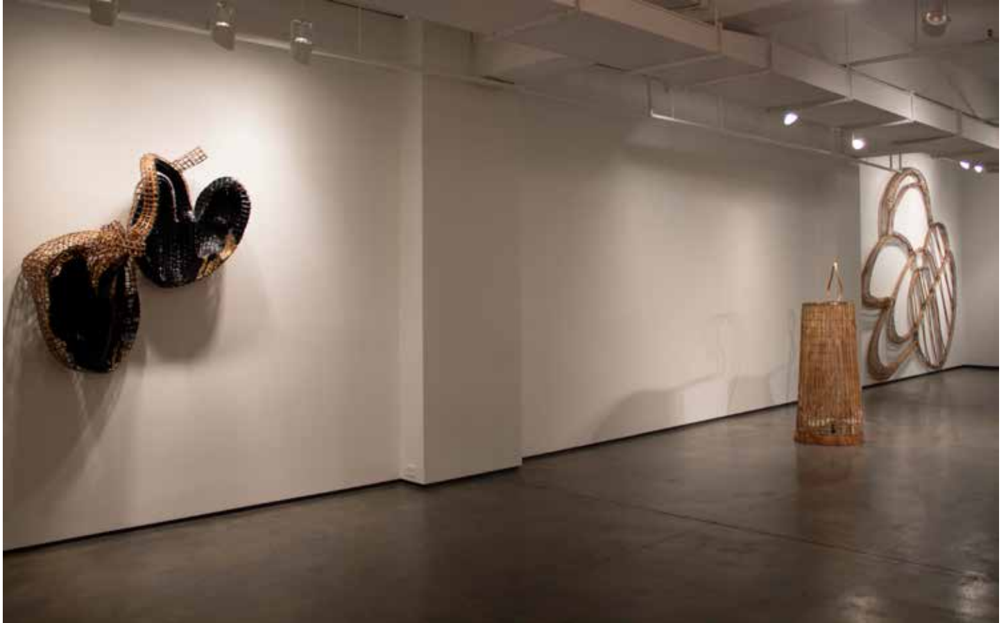
VIEW OF THE EXHIBITION AT TYLER ROLLINS FINE ART