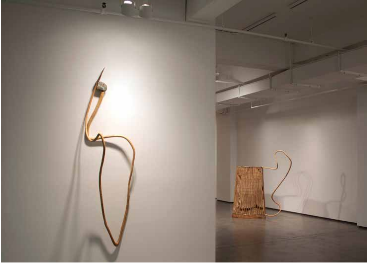
VIEW OF THE EXHIBITION AT TYLER ROLLINS FINE ART