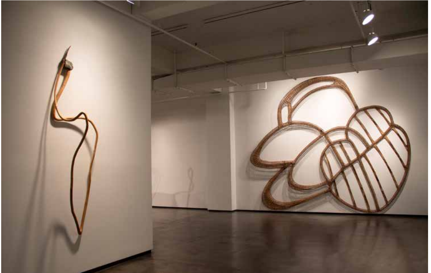
VIEW OF THE EXHIBITION AT TYLER ROLLINS FINE ART