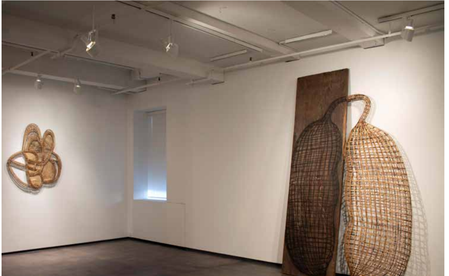
VIEW OF THE EXHIBITION AT TYLER ROLLINS FINE ART