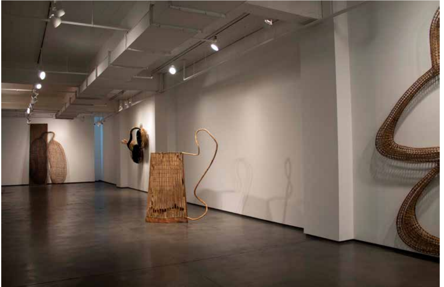
VIEW OF THE EXHIBITION AT TYLER ROLLINS FINE ART