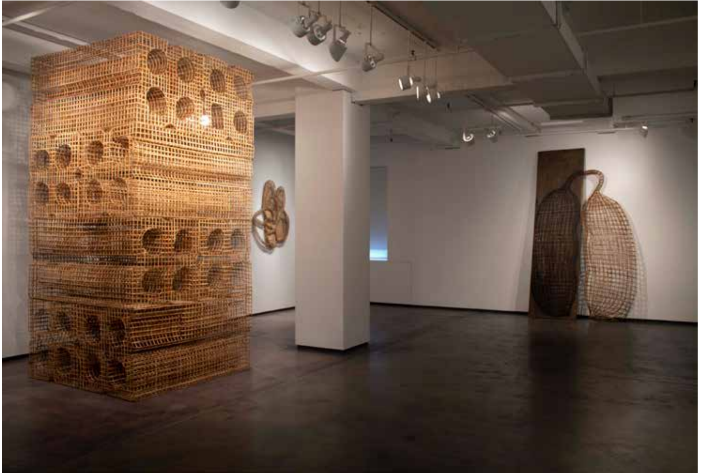
VIEW OF THE EXHIBITION AT TYLER ROLLINS FINE ART