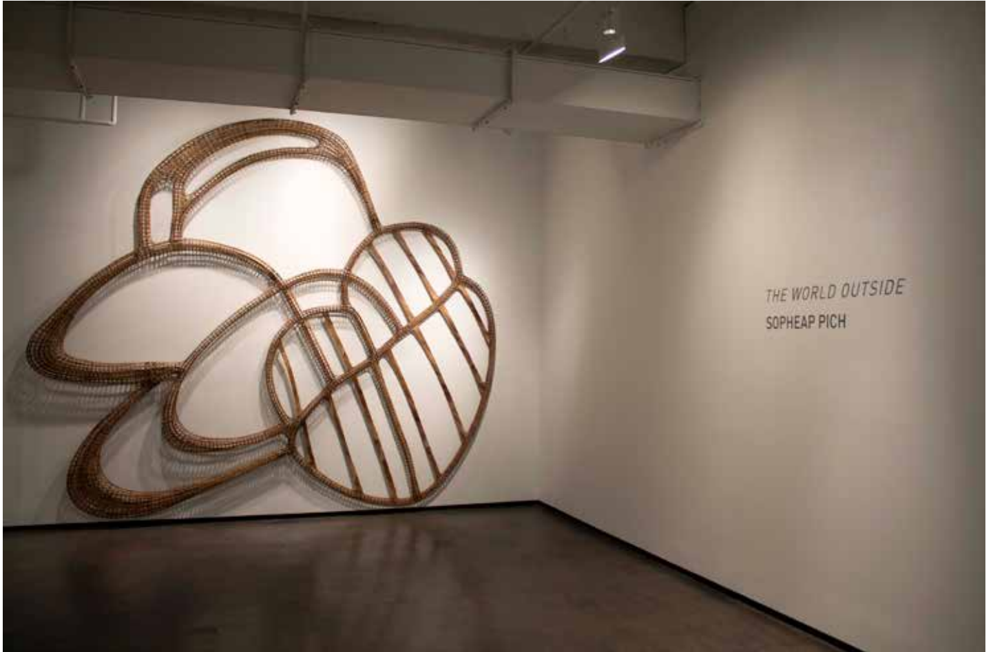
VIEW OF THE EXHIBITION AT TYLER ROLLINS FINE ART