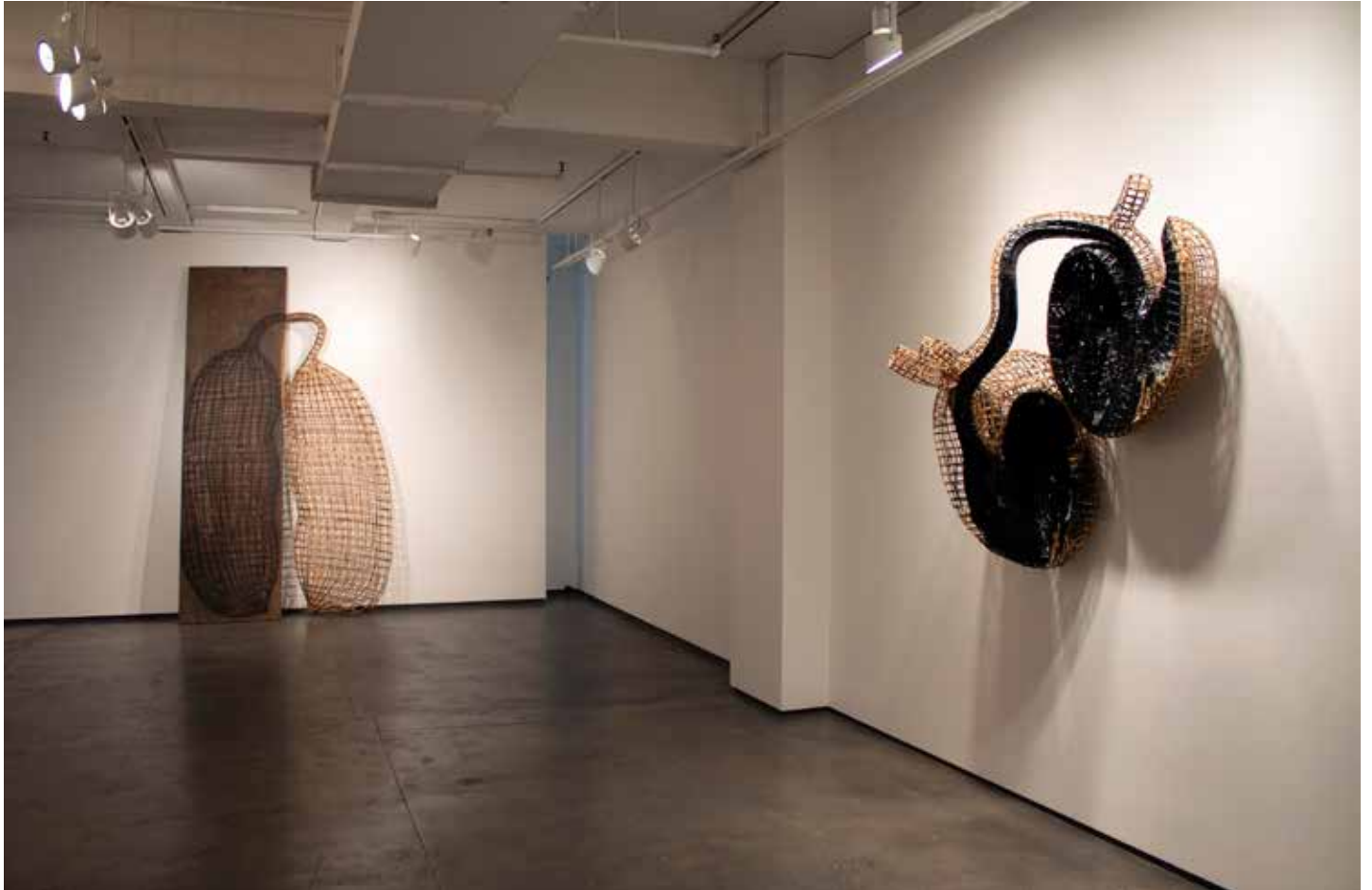
VIEW OF THE EXHIBITION AT TYLER ROLLINS FINE ART