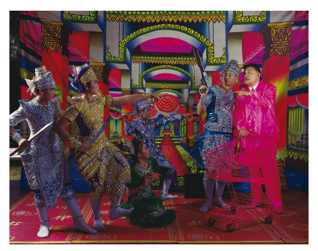
Manit Sriwanichpoom: Pink Man Opera #3: Do not export family secrets; do not import trouble from outside , 2009, C-print, 20 by 24 inches.

At the center of this development is the contemporary art scene of Thailand, currently concentrated in Bangkok, the nation's capital, and Chiang Mai, a comparatively relaxed city in the northwestern region of the country. (The provincial outpost—relatively cheap and milder in climate—offers residency programs, collectives, a university arts center and a small but growing number of commercial galleries, all some 430 miles away from the grimy turmoil of Bangkok.) Over the past two decades, the country's experimental artists have increasingly exhibited in Asia, America and Europe. In addition, Thailand has sponsored a national pavilion at four consecutive Venice Biennales since 2003, a record unmatched by any of its Southeast Asian neighbors. Sculptor and installation artist Montien Boonma (1953-2000), known for melding Buddhist beliefs with a modernist sensibility, was posthumously honored by a major retrospective—"Montien Boonma: Temple of the Mind"—at New York's Asia Society and Museum in 2003 [see A.i.A., Feb. '04]. And Rirkrit Tiravanija, born in Brazil in 1961 to Thai parents, gained worldwide attention with his food-sharing "stir fry" events