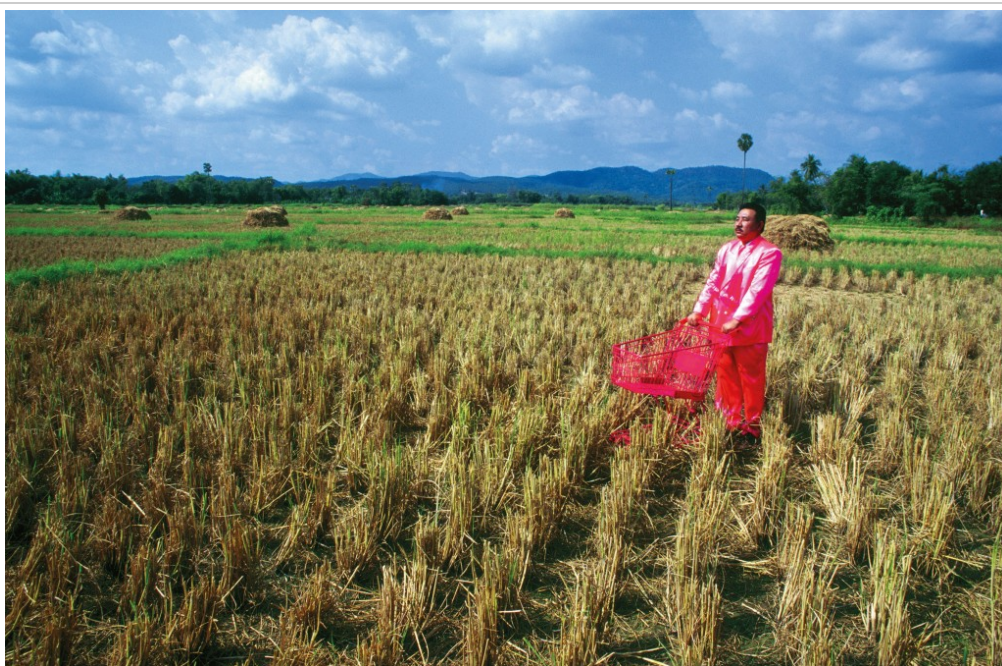
Mani Sriwanichpoom's "Pink Man On Tour #6 (Amazing Rice Field. Northern Thailand)"

THAI CAPTION is a project by Fulbright research grantee Ellen Adams to document and analyze Thai contemporary art, with a particular focus on politically and socially engaged art.