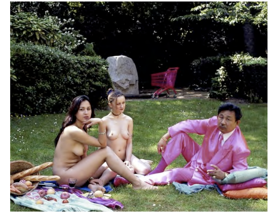
Manit Sriwanichpoom, 'La Vie en Pink # 2', 2004, C-print, edition of 10, size 76 x 95 cm.

I didn't like the coup, but I understood the people posing for pictures with soldiers. I understood their relief and joy.