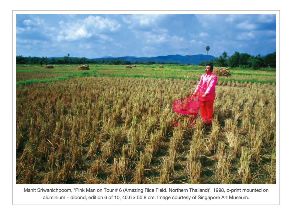
While you criticised tourism in "Pink Man on Tour", you travelled quite a bit yourself to conceive the series. What is the most memorable place you've been to?

I haven't thought of it yet. Maybe in the future. Let's see how the economic crisis has changed the U.S..