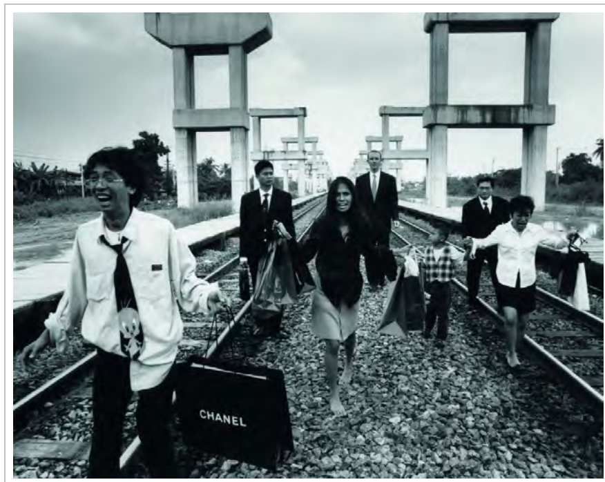
Manit Sriwanichpoom, 'This Bloodless War # 3', 1997, gelatin silver print, edition of 5, 50.8 x 61 cm.

In your series "The Bloodless War", you made reference to the famous news photograph of Kim Phúc and siblings fleeing a South Vietnamese napalm attack on their village during the Vietnam War. Your image ( The Bloodless War # 3 , 1997) portrays a kind of contemporary war. What is this war about and why are all of your subjects running on a railroad?