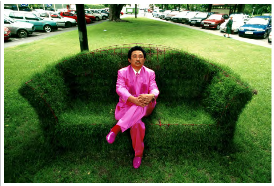
Manit Sriwanichpoom, 'Pink Man on European Tour # 1 (Graz)', 2000, c-print mounted on aluminium – dibond, edition of 10, 40.6 \times 50.8 cm.