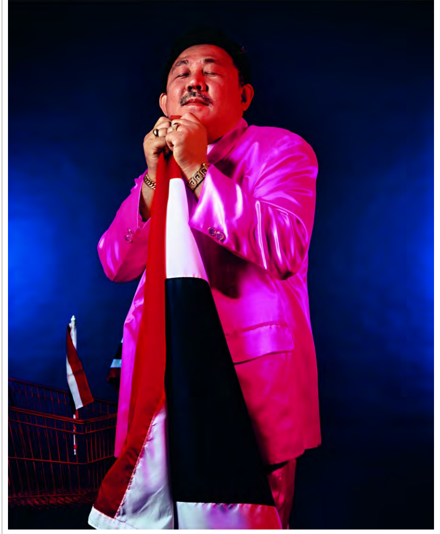
\label{eq:main_section} \begin{tabular}{ll} Manit Sriwanichpoom, 'Pink, White \& Blue \# 3 (The Scent of Love)', 2005, c-print mounted on aluminum – dibond, edition of 12, 61 x 50.8 cm. \end{tabular}

In "Pink, White & Blue", you portrayed a classroom parody where the children are literally blinded. Likewise in "Embryonia", the children's feet are bound. Are you pessimistic about these children's future, and do you believe anything can improve their future?