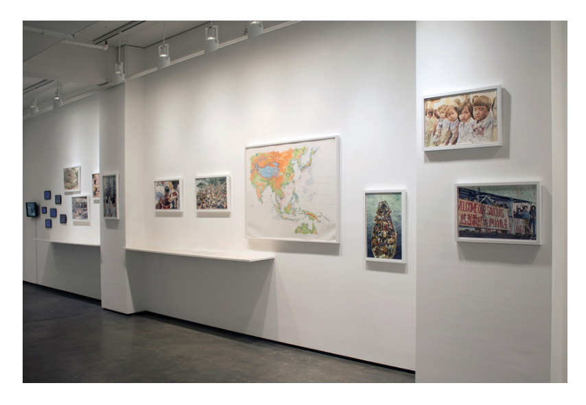
Installation view of TIFFANY CHUNG 's "Unwanted Populations" at Tyler Rollins Fine Art, New York, 2017.