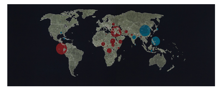
TIFFANY CHUNG , IDMC: Numbers of Worldwide Conflict and Disaster IDPs by End of 2016 , 2017, embroidery on fabric, 140 × 350 cm. Courtesy the artist and Tyler Rollins Fine Art, New York.

On view in Chelsea's Tyler Rollins Fine Art were Chung's most recent works. "Unwanted Populations" was an exhibition that highlighted not only the refugee crisis that impacted the artist's own kin, but also more recent flashpoints, from the attacks by Boko Haram that have displaced thousands in Nigeria, to the ongoing conflict in Syria. In Mapping a Conflict Without Border: Areas of Influence in Syria and Iraq (all works 2017), we see how the constructed borders of nations are made inconsequential by the spread of the so-called Islamic State within Syria and Iraq, represented by red and black dots rendered in acrylic, ink and oil on vellum. Under the artist's treatment, the map looks chaotic, in flux, and marked by the advance and ebb of violence, with ground held or lost by ISIS appearing as if it is still being redefined by momentary occupation.