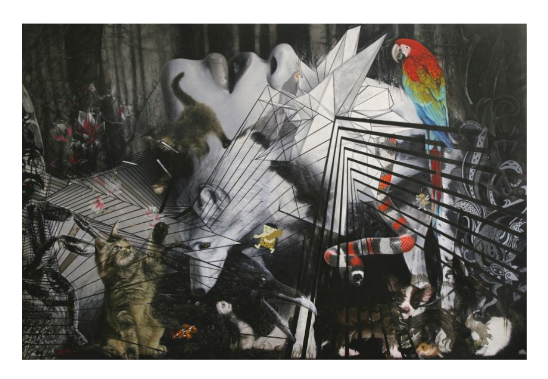
Ronald Ventura – Forest, 2015