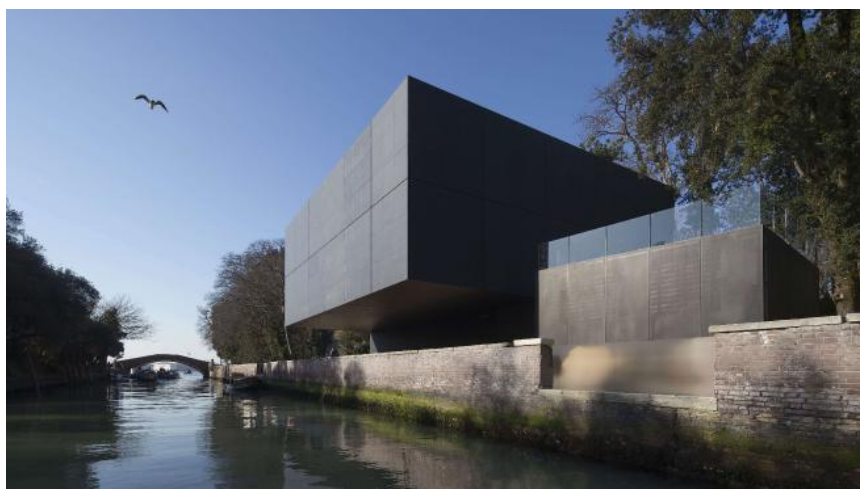
The Australian Pavilion in Venice.