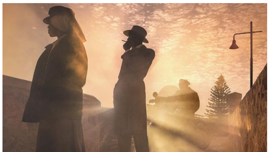
Hell from the Passage series, which makes up part of Moffatt's Venice exhibition.

What's going on? A hint is in the title of the series, called Passage , and a printed statement that refers to legal and illegal journeys. The mind races ahead, trying to connect the figures into a story. Perhaps it's about people-smuggling, or an escape from a violent place.