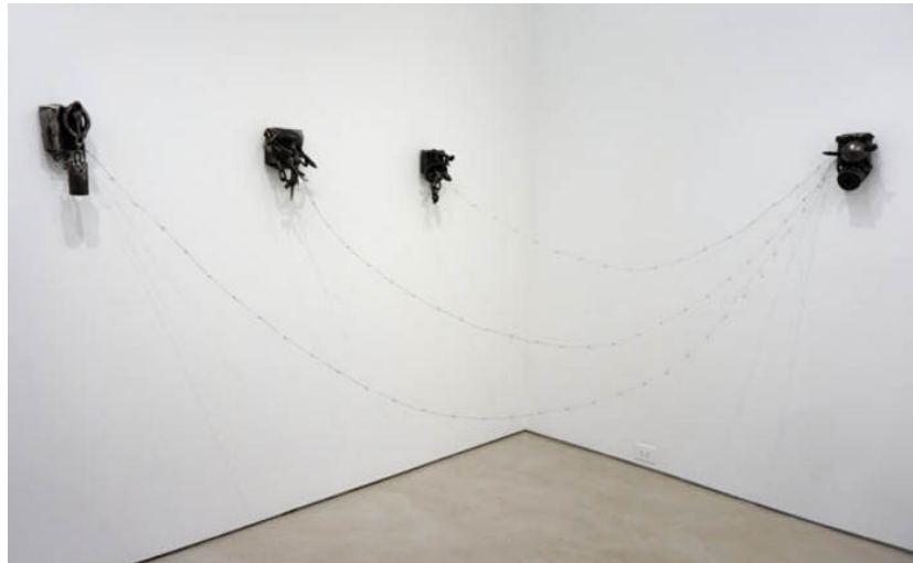
Melvin Edwards: In Oklahoma at Alexander Gray Associates.