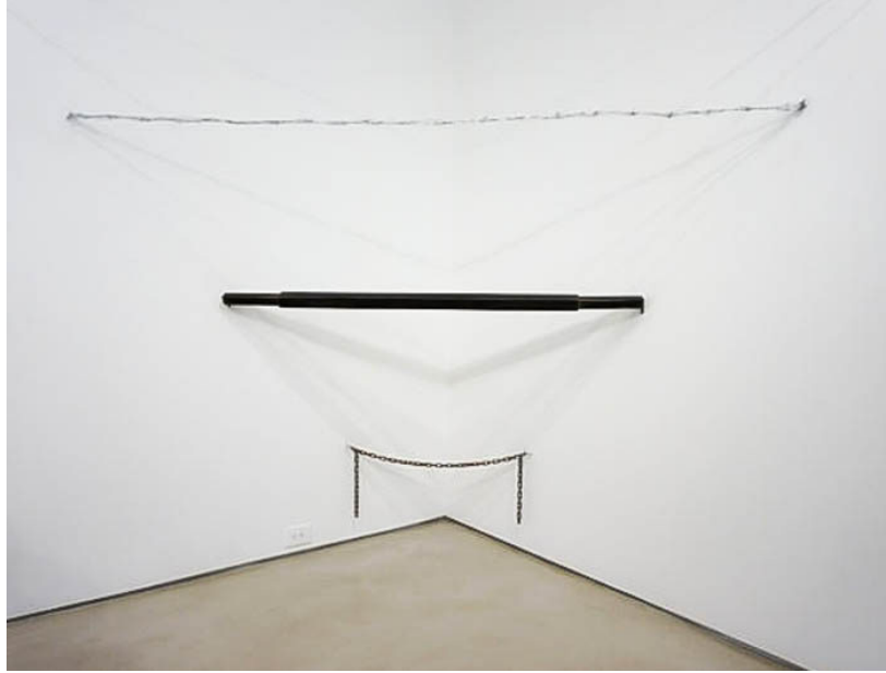
Melvin Edwards: In Oklahoma at Alexander Gray Associates.