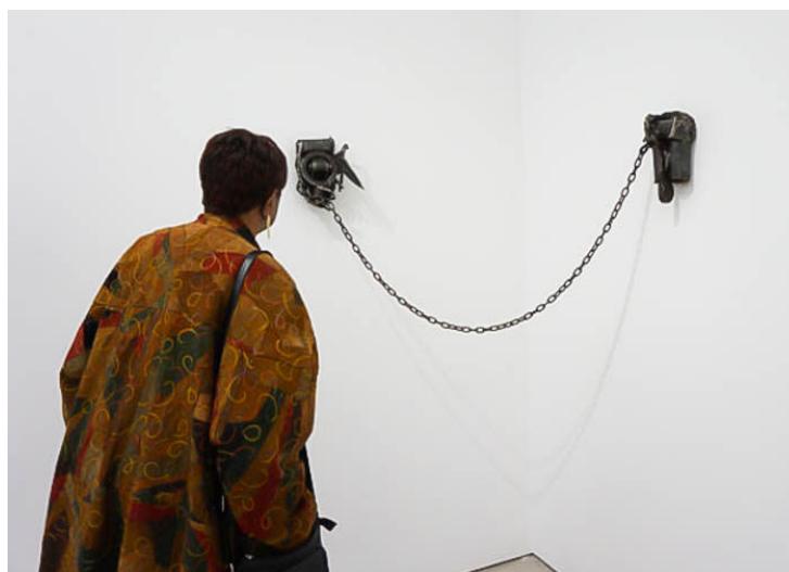
Melvin Edwards: In Oklahoma at Alexander Gray Associates.