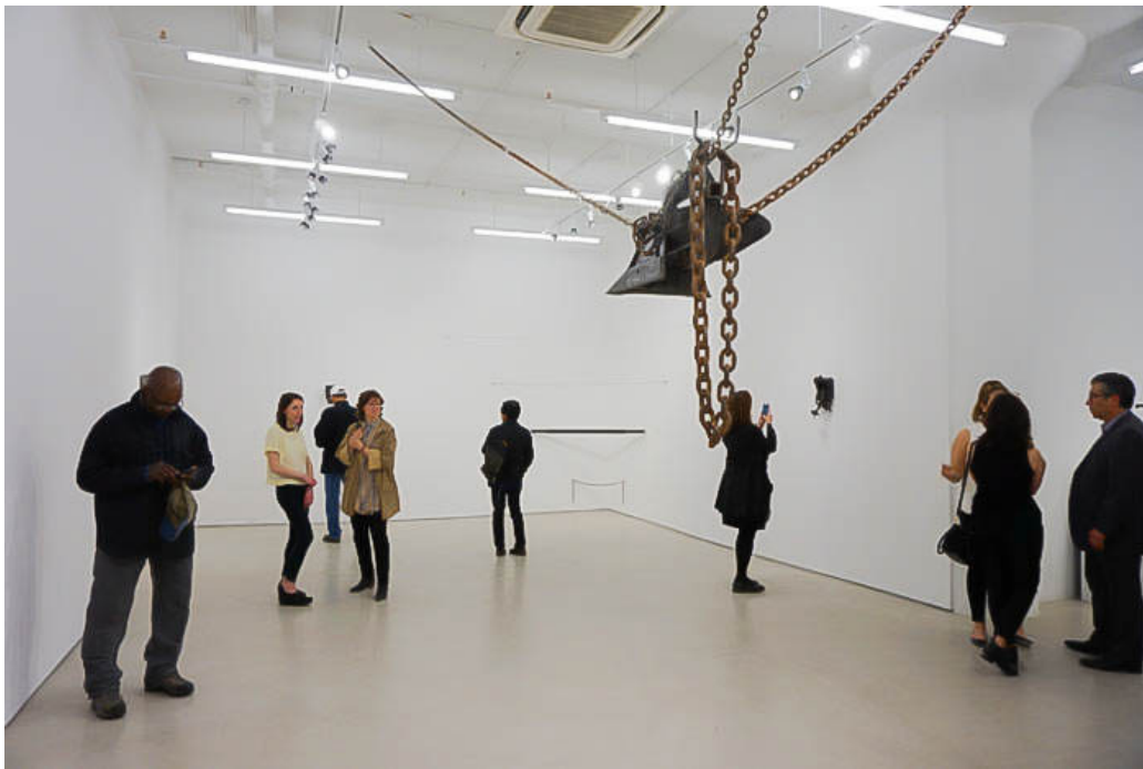
Melvin Edwards: In Oklahoma at Alexander Gray Associates.