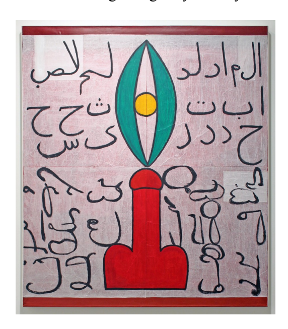
Linnga Yoni, 2013

What they objected to was, in that piece Lingga-Yoni , you see those Arabic letters, like ABC, and at the top it says: "Nature is a book." This is an Arabic script modified for local language in Indonesia. So in this piece I say that nature is a book. So there is this Arabic script there in combination with this lingga and yoni and I am afraid they did not know the meaning of this lingga and yoni symbol, for them it was just a terrible image to show because it is an image of the vagina and the phallus. I tried to explain to them that for Hindus this is a sacred kind of symbol. It has nothing to do with something derogatory or dirty. But they didn't accept this.