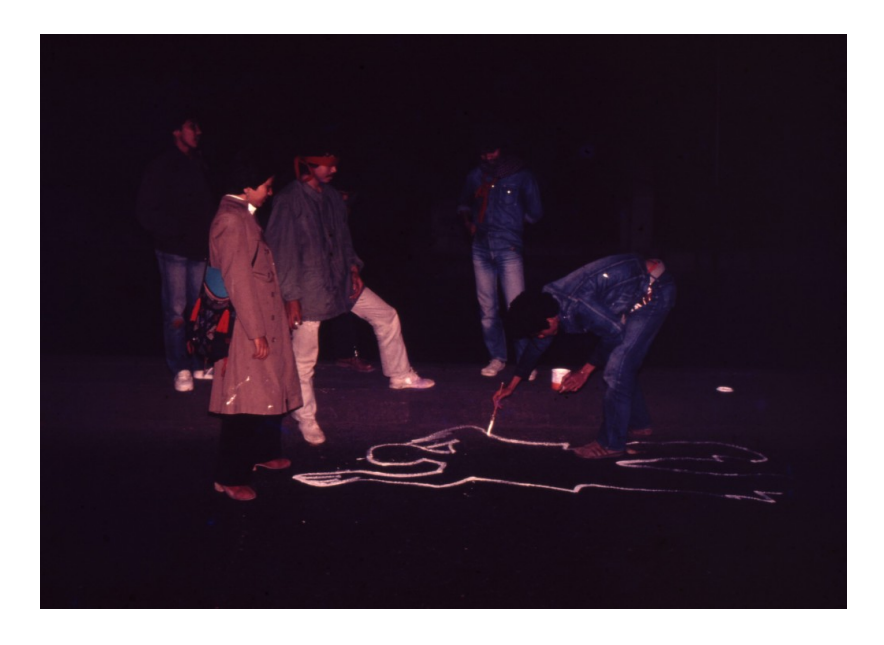
Accident, 1980 (Performance, Bandung, Indonesia)

In conjunction with that first question, I don't know how strict Indonesia is about following Muslim rules of propriety, but I wonder if it was an issue that a woman was performing in front of people? Did it ever become a religious issue? I would think that it is a feminist act in that context for a woman to put herself in the public sphere, especially since stricter versions of Islam want to keep women restricted to the private sphere. Isn't it a radical act in itself to place yourself in the public sphere as a performance figure?