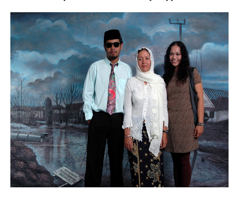
Produk Gertoli, 2008 (Performance, Sanata Dharma, Yogyakarta, Indonesia)

Now that we have mentioned the environment, in the room we are in (This interview was conducted at Tyler Rollins gallery in New York City during a retrospective exhibition by Arahmaiani in January of 2014.) there is a survey of your performance work and in one of the pieces, which is called Produk Gertoli , 2008, you have people posing the way they might in front of a tourist attraction but instead they are posed in front of an industrial accident. I wonder if you could tell us more about the context for this piece. Was the accident caused by Indonesian industry or by a multi-national corporation? What exactly happened at this site?