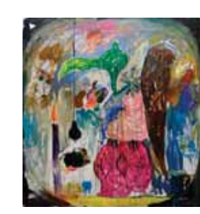
Untitled (Maybe this could be....) acrylic on canyas 75" x 78 1/2"