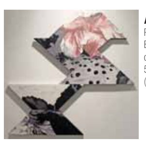
Flowers for X