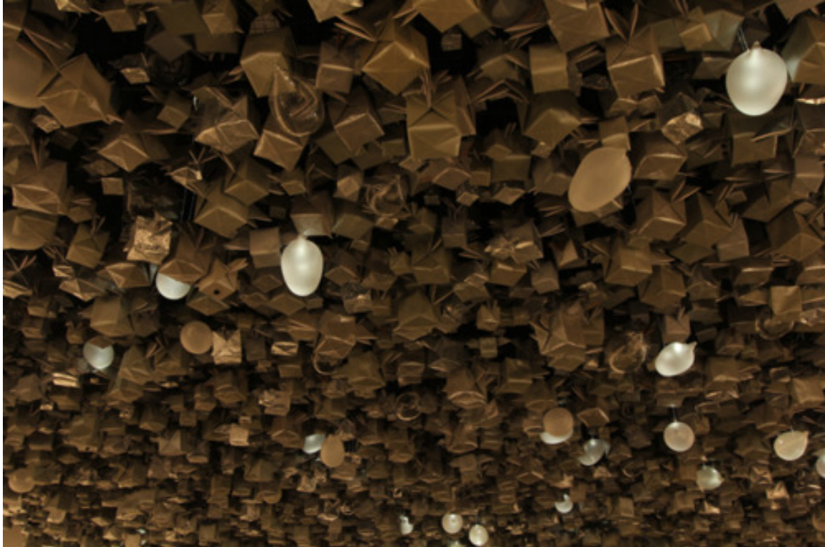
Pinaree Sanpitak, Anything Can Break , 2011 (detail)

'The sound interactive installation was very nice, too. Moving around the space as drawn by the slightly moving cubes and clouds, every few metres, the music changed, with many people in the space at the same time, the music was randomly mixed... the whole space became a forest of sounds, clouds and cubes.'