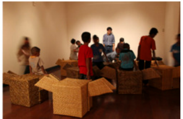
Pinaree Sanpitak, 'Flying Cubes' project in Chiang Mai

These 'Flying Cubes' - in the original paper form - fitted perfectly with the glass breast clouds. (I finally found a Thai glassmaker who was able to make the glass pieces. Although totally different methods from the masters in Murano, it worked because they were much lighter and had the perfect finish in the way it was to hang).