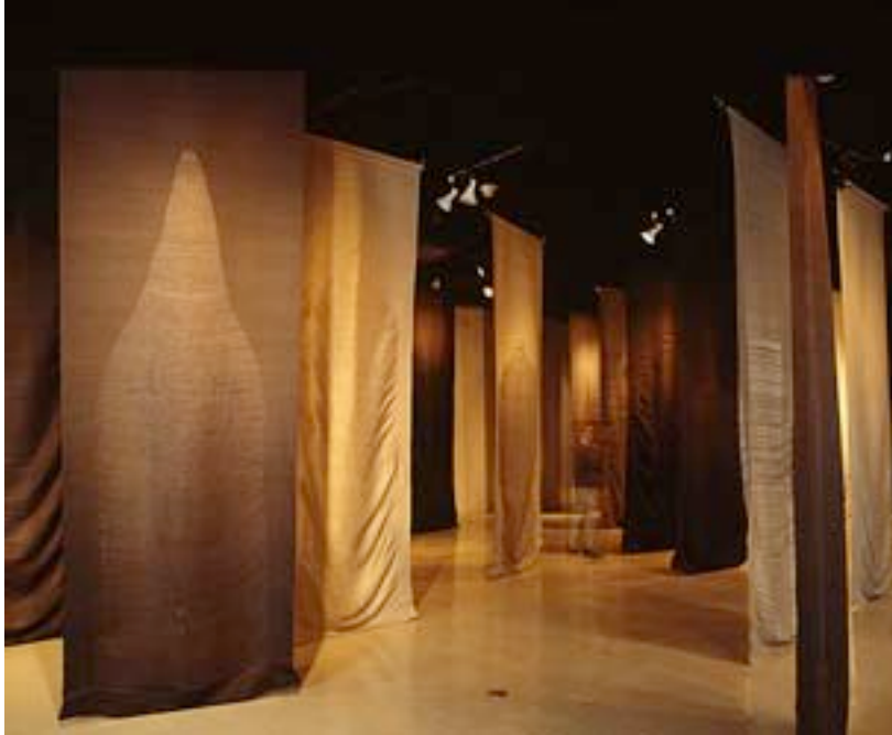
Pinaree Sanpitak, Breast Stupas , 2000–01

‘Artistic chameleon and feminist artist’ is the way Art Radar Asia aptly describes Pinaree Sanpitak in a review of ‘Quietly Floating,’ her first exhibition in New York City in 2010.