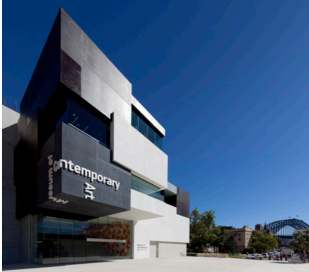
Entrance to the Museum of Contemporary Art Australia

I know Anything Can Break will be installed in the newly reopened Museum of Contemporary Art Australia (MCA) whose ceiling height has now been doubled (the museum was closed for renovations when I was staying in Sydney a few weeks ago).