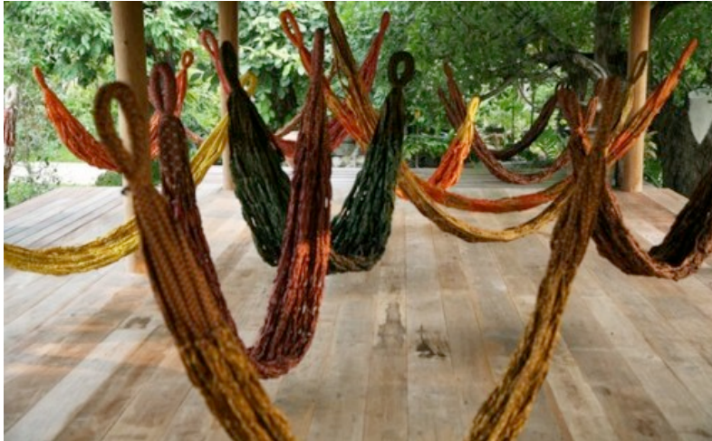
Pinaree Sanpitak, Hanging by a Thread , 2012

cotton Paa-Lai fabrics of the type that were included in the royal sponsored relief bags, Pinaree has constructed a group of woven hammocks that will be suspended in the gallery from slender threads. These quiet, cocoon-like forms evoke a sense of nurturing, refuge, and contemplation, as well as the precariousness of life. Pinaree explains that “the Paa-Lai hammocks represent the situation of precarious times balancing traditional and modern values. The hammocks are presence of the body, bare and contemplating. The body waiting to slow down. The body floating. The body just hanging by a thread. Thus a situation I believe we all share.”