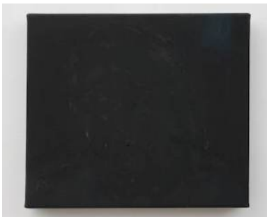
Maaïke Schoorel, Ilan met turban (Ilan with turban) , 2011, purchased with funds provided by Emily and Teddy Greenspan through Contemporary Friends, 2013

Two paintings, one by Amy Sillman and another by Maaïke Schoorel, explore different strategies in composition and subject. Amy Sillman's work, Untitled (Purple Bottle) , challenges the boundaries between abstraction and figuration, while demonstrating her skills as a formidable colorist. The canvas is comprised of various ambiguous forms and lines rendered in bold and pastel colors—pinks, greens, purples, and grays. There are gestures toward representation: the handle of the "Purple Bottle," for instance, is implied by the green handle, but lines around it disrupt the figurative. Schoorel's work, Ilan met turban (Ilan with turban) , initially appears all black, but, upon closer observation, a figure—that of a head—reveals itself. The viewer is required to invest time and to focus in order to see the form in the otherwise minimalist canvas.