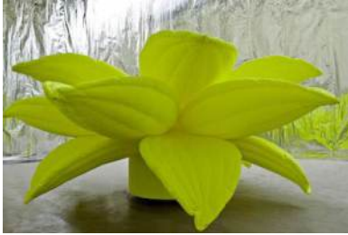
Choi Jeonghwa, Flower, Flower , 2008, purchased with funds provided by Contemporary Friends, 2013

Edgardo Aragón's La Trampa tells the story of an Oaxacan village and looks at the landscape of this Mexican state for inspiration. Mohamed Bourouissa's Temps Mort records a yearlong dialogue between the artist and a friend who was incarcerated for a minor offense. The video installation features mobile-phone recordings made by his friend. These two acquisitions, along with Henrot's Grosse Fatigue , not only add to the depth of our holdings of video and time-based media, but also complement LACMA's Art+Film initiative, which aims to present the moving image in the context of an art museum.