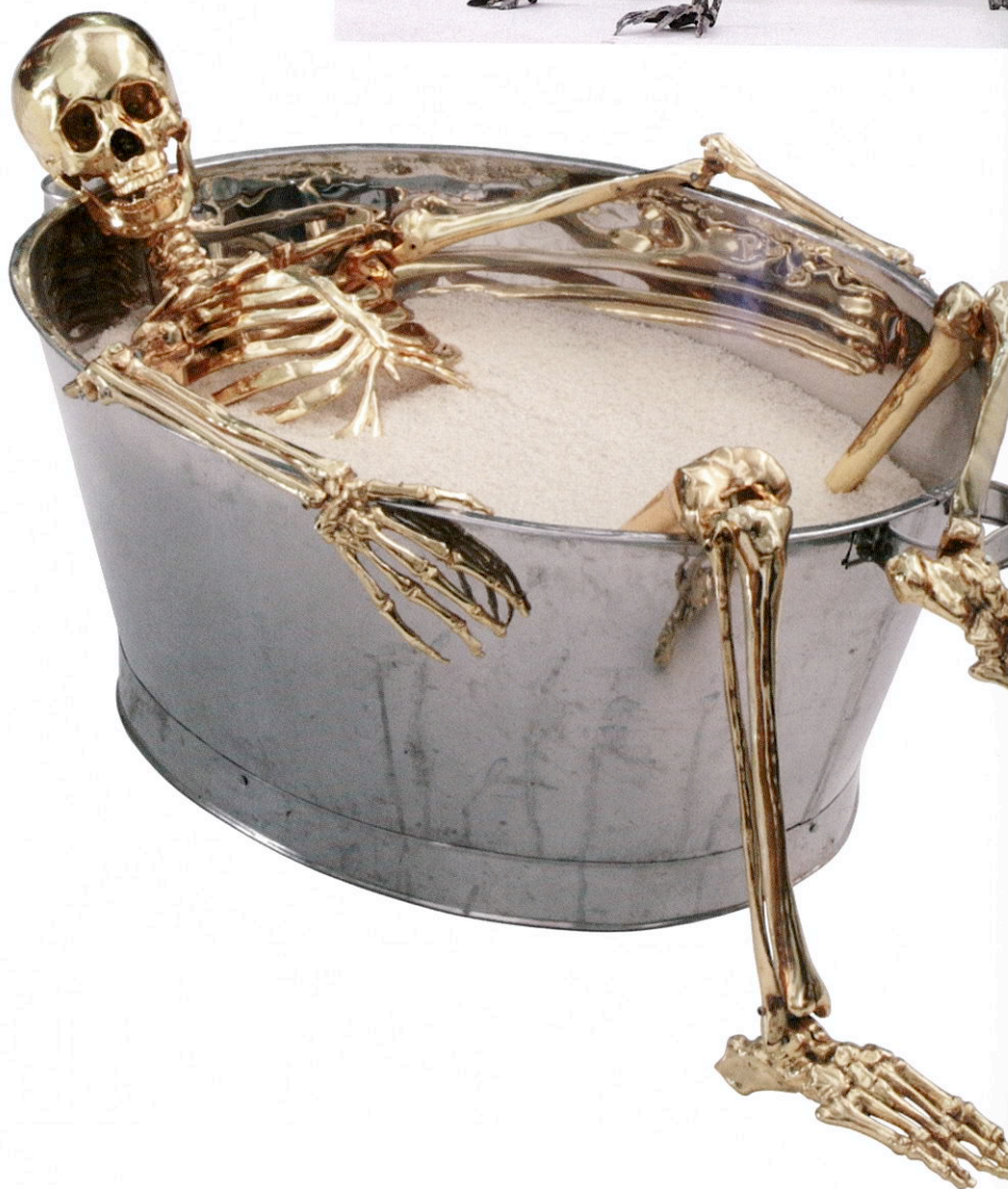
Happiness Is a Warm Gun , 2011 Zinc, acrylic, iron and LED lightbox, 135 x 120 x 160 cm Private collection