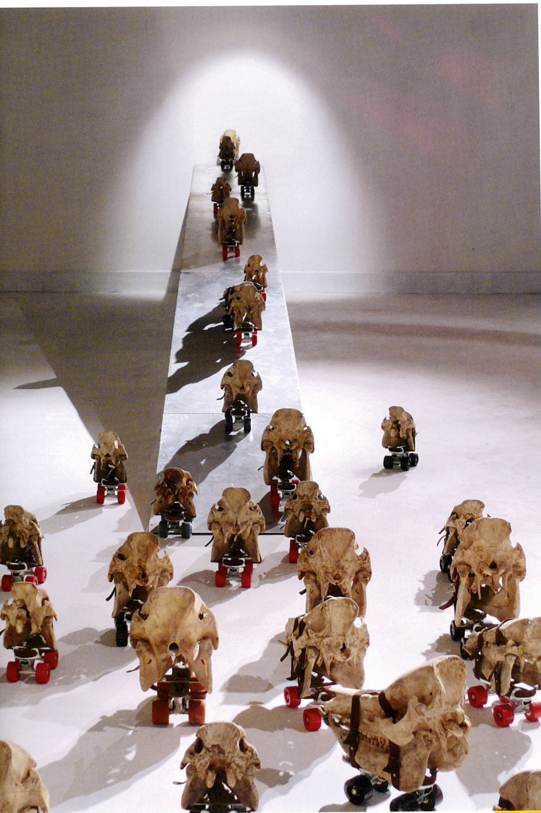
Are You Going with Me? , 2006–07 Resin, aluminium, roller skates, leather, variable dimensions Collection of the artist