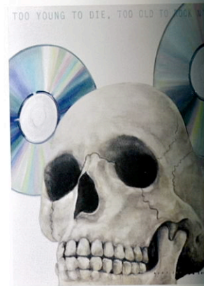
Man of the Year , 2009 Oil on linen, 200 x 250 cm Private collection Courtesy of the artist