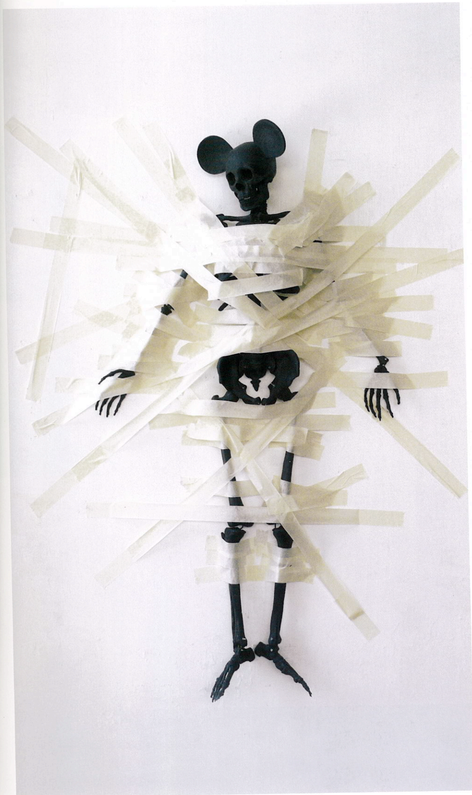
Fool in Love , 2009 Graphite and duct tape, variable dimensions Private collection