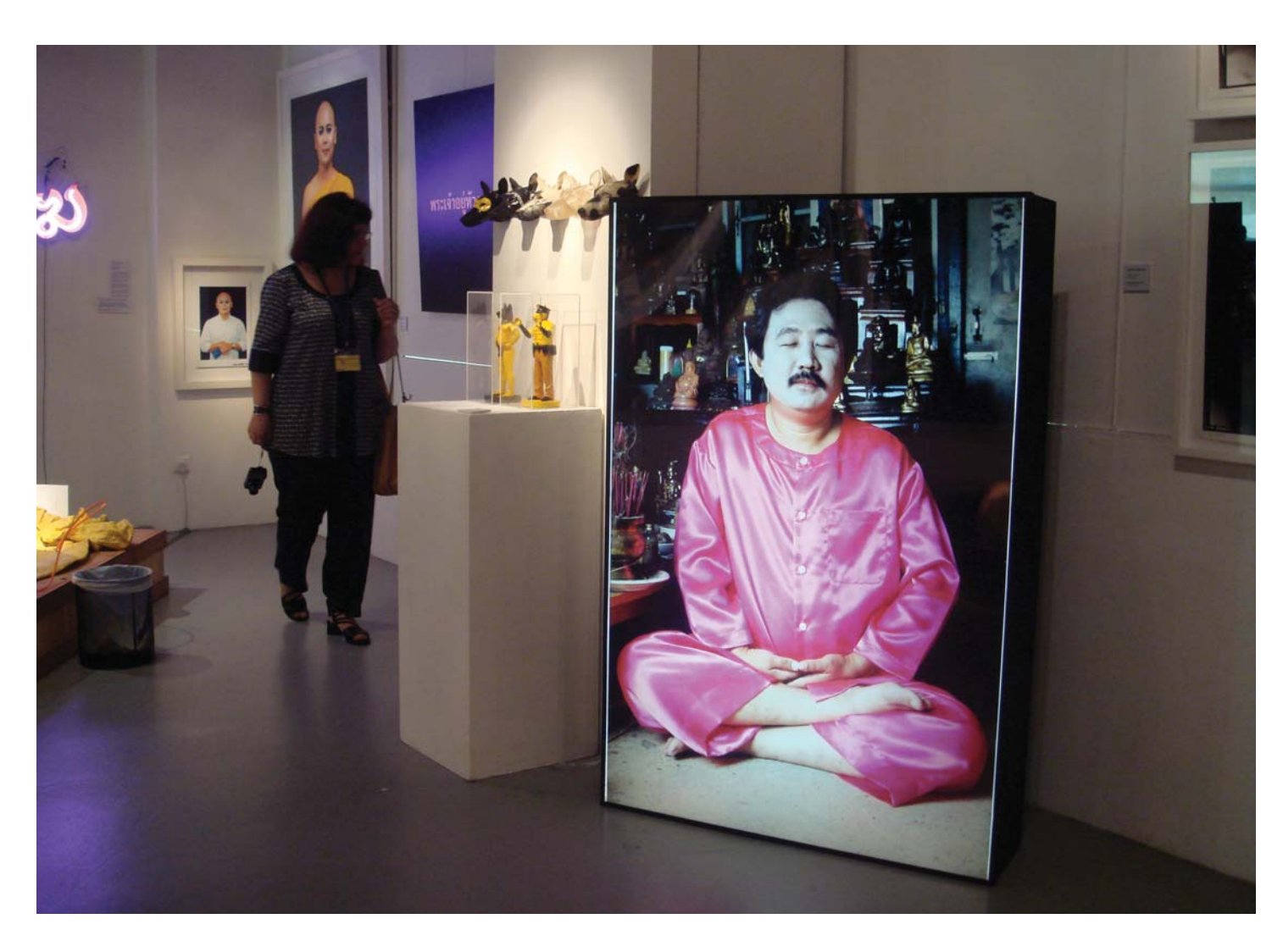
Manit Sriwanichpoom, title of work TK, year of creation TK, installation view, Alliance Française de Singapour, May 2008 (artwork © Manit Sriwanichpoom; photograph by the author)

17. Iola Lenzi, "FX Harsono at SAM: How Exhibitions Can Build the Canon," C-Arts 13 (March–April 2010), available online at www.c-artsmag.com/betac-artsmag/index.php/articles/view/121.