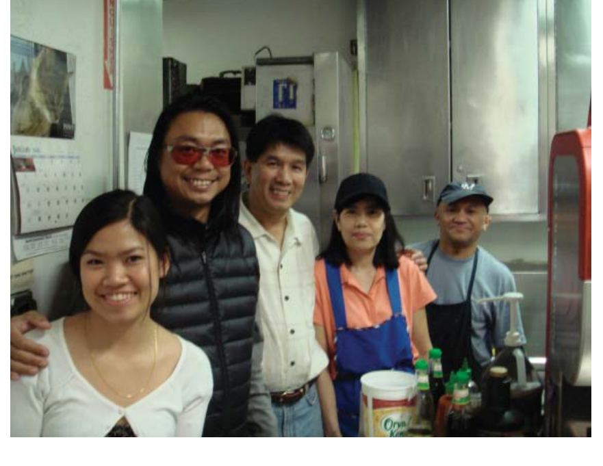
Rirkrit Tiravanija with the staff of Sunny's Café at the School of the Art Institute of Chicago, January 2008

as art advisors and curators rather than dealers. Similarly, artist-run spaces have acted as agents for younger artists, securing clients and negotiating exhibitions with international museums. In Vietnam, spaces such as Nha San Duc in Hanoi and San Art in Ho Chi Minh City have acted as liaisons between collectors and buyers, curators and museums. In Singapore, the Substation has acted as a forum for experimental art practices, and in Indonesia, Cemeti has created a space for artists and critics to research contemporary art practices and create works without government interference. In Ho Chi Minh City, a number of spaces for readings, lectures, and exhibitions have recently opened, such as Wonderful District, Zero Station, Salon Himiko, and Rich Streitmatter-Tran's Dia Projects. These are grassroots projects that are fitting to Southeast Asian circumstances because most of these countries, aside from Singapore, lack the proper infrastructure for art to thrive on an official level. It takes individual initiatives to get things moving.