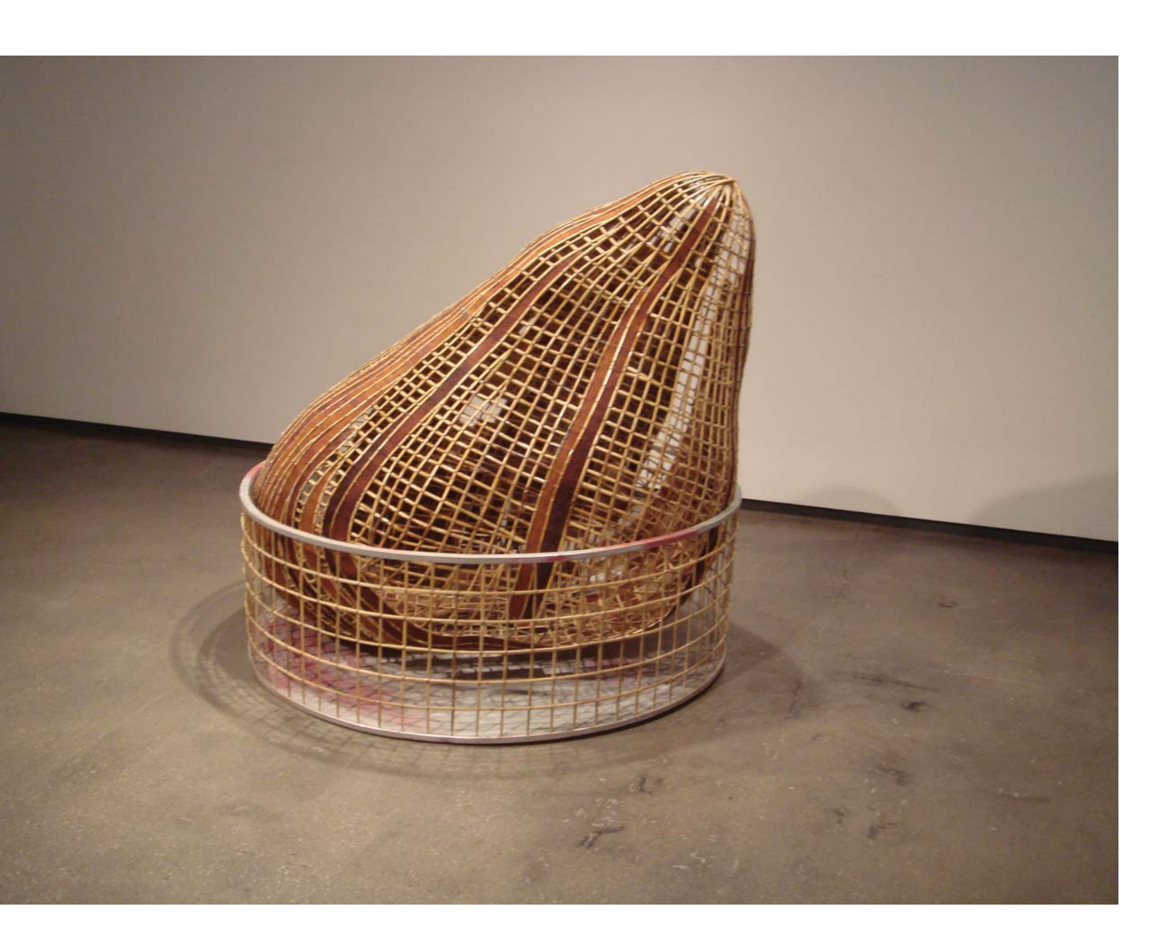
Sopheap Pich, Caged Heart, 2009, wood, bamboo, rattan, burlap, wire, dye, metal farm tools, installation view, Tyler Rollins Fine Art, New York, 2009 (artwork © Sopheap Pich)

The critic Lee Weng Choy once described Singapore as an "ahistorical society that seems to live only in the present tense, and claims no need for the past, let alone a sophisticated consciousness of history." In Lee's view, Singapore suffers from a case of postmodernity. But to deny it history is vaguely reminiscent of a time, during the period of colonialism, when all Southeast Asians were denied a history as well as a present. When colonial explorers came to the "lands below