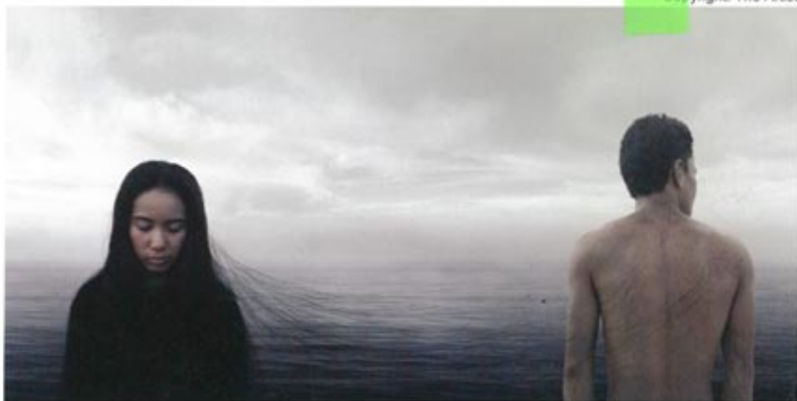
<Sulu Stories-Landmark>, 2005

Digital Print on Kodak Endura Paper 183 x 61 cm Copyright: The Artist