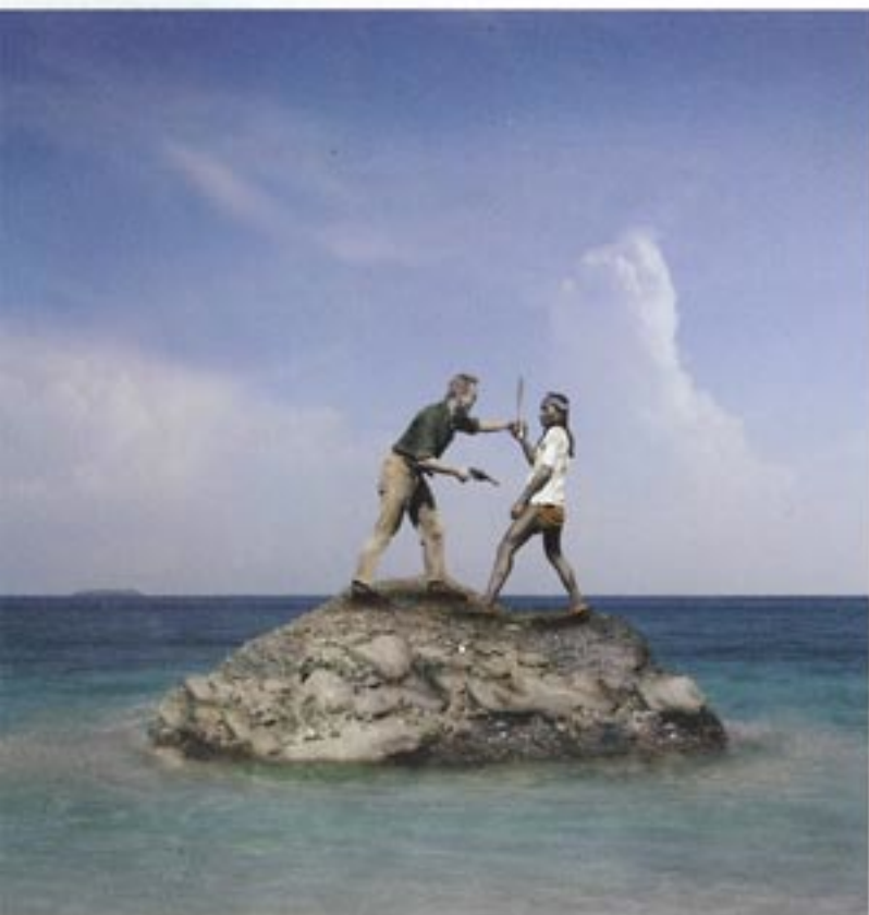
<Sulu Stories-High Noon>, 2005 Digital Print on Kodak Endura Paper 61 x 61 cm