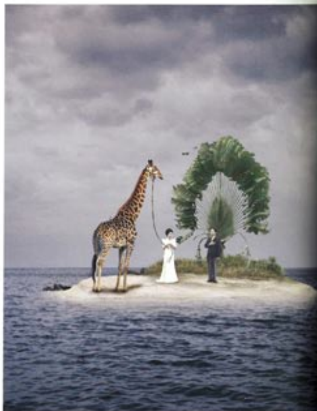
<Sulu Stories-The Ch'i-lin of Caluit>, 2005 Digital Print on Kodak Endura Paper 61 x 61 cm