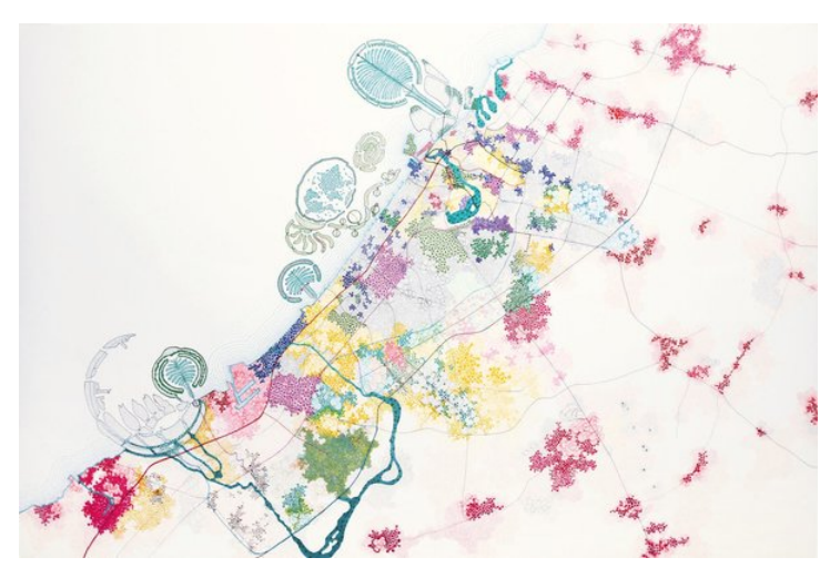
A work by Tiffany Chung that overlays 1973 and 2009 maps of Dubai with one showing planned development through 2020.