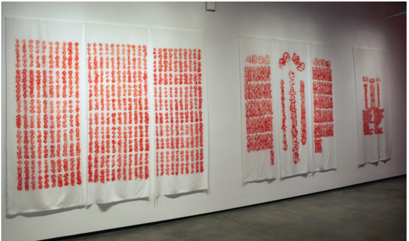
FX Harsono, "Rewriting on the Tomb" (2013), series of digital prints on textile dimensions variable

Without being overtly heavy-handed, Harsono's empowerment of a discriminated minority in his country opens up a larger conversation on exclusion and nationalism around the world, making his activist practice particularly relevant in the current climate fraught with renewed ethnic violence.