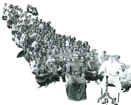
Yee I-Lann, Picturing Power: Wherein one nods with political sympathy and says I understand you better than you understand yourself, I'm just here to help you help yourself , 2013, giclée print on Hahnemühle Photo Rag Ultra Smooth Fine Art 310 gsm 100% cotton rag paper, 63 x 63 cm. Edition of 8 + 2 APs.

Born in 1971 in Sabah, Malaysia, Yee received her BA in Visual Arts from the University of South Australia, Adelaide, in 1993, and lives