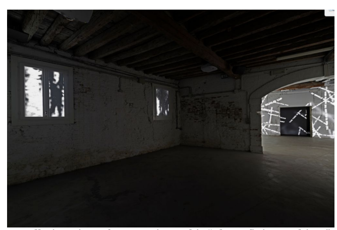
Installation view of Tsang Kin-Wah's "The Infinite Nothing."

The Venice Biennale, with its global array of national pavilions, allows visitors to make like Marco Polo and sail east, while remaining rooted in the West. The Korean and Japanese pavilions in the Giardini are a good place to start, but going a little further afield to the back streets of the Arsenale can provide a glimpse into the art worlds of China, Turkey, Singapore, Indonesia, Hong Kong, and even the little-known island nation of Tuvalu.