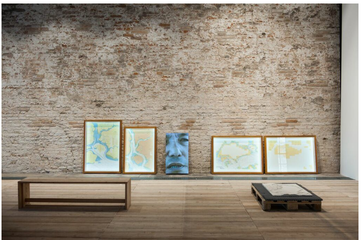
Installation view of Charles Lim's show in Singapore's pavilion.

BY Barbara Pollack POSTED 05/07/15 4:54 AM