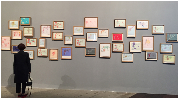
Installation view, The Syria Project , Venice Biennale 2015.