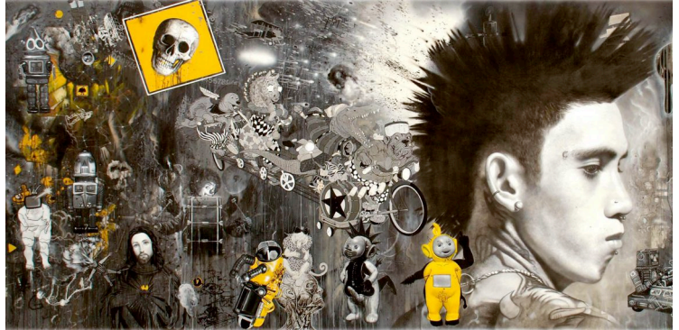
Under the Rainbow, 2007