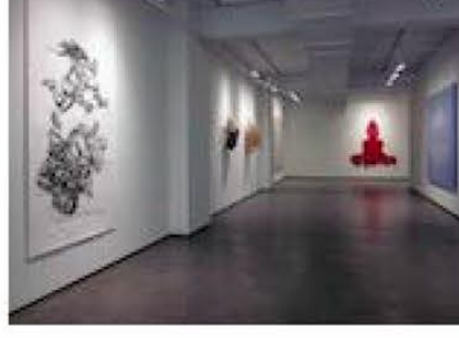
SUMMER GROUP SHOW JUNE 27 - AUGUST 9, 2013