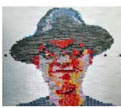
AGUS SUWAGE: CYCLE NO. 2 FEBRUARY 29 - APRIL 18, 2013