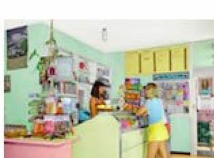
TRACEY MOFFATT OCTOBER 24 - DECEMBER 21, 2013