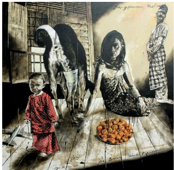
Bangsawan Melayu, 2010, acrylic and bitumen on canvas, 54 x 54 in.