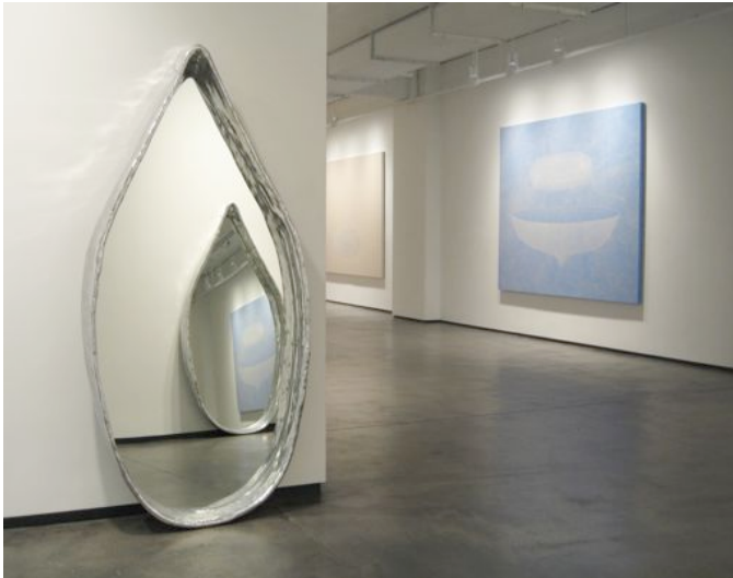
Installation view of exhibition at Tyler Rollins Fine Art