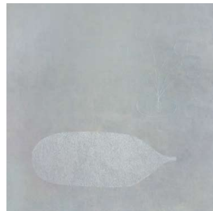
Cloud Sprout , 2008, acrylic on linen, 78 x 78 in. (198 x 198 cm)