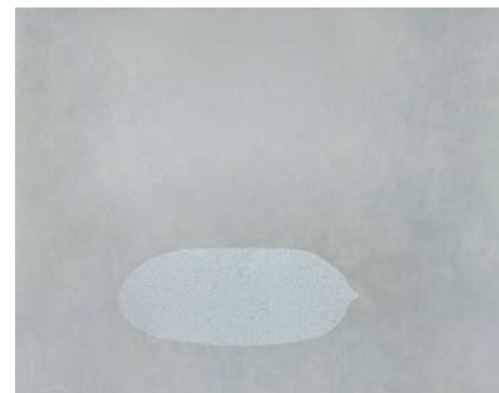
Cloud Track , 2008, acrylic on canvas, 78 x 98 ½ in. (198 x 250 cm)