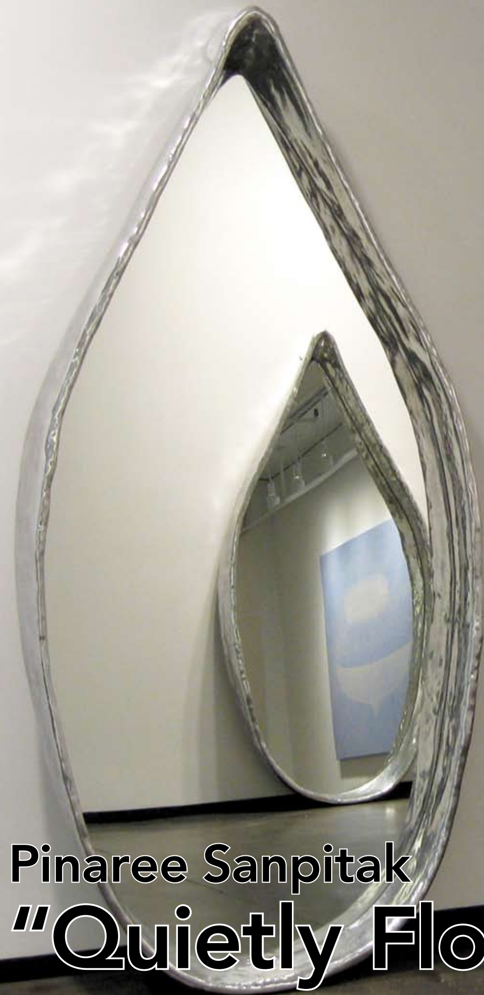
The Mirror , 2009 Aluminum and mirrored glass Edition of 6 + 2 AP 37 ½ (height) x 76 (length) x 7 (depth) in. (95 x 193 x 18 cm)