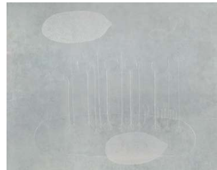
Cloud Garden , 2008, acrylic on canvas, 78 x 98 ½ in. (198 x 250 cm)

In "Quietly Floating," these images exist in a subdued atmosphere, the paintings like clouds in a minimalist environment. She pairs down the figural elements, doing something comparable with her titles, which are usually short provocative one-liners that enhance the work. Like clouds, you can imagine many things in these paintings—the rounded ovals like mysterious organisms or elongated breasts