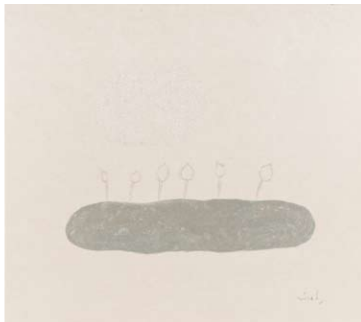
Works on Paper 3, 2008-9, acrylic on shikishi paper, 9 1/2 x 10 3/4 in. (24.1 x 27.3 cm)