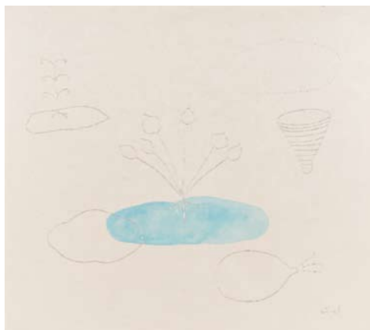
Works on Paper 4, 2008-9, acrylic on shikishi paper, 9 1/2 x 10 3/4 in. (24.1 x 27.3 cm)

and noon-nom, and stupas. But though she supports feminism, she expresses no feelings of victimization. Though not religious, she employs Buddhist symbols.